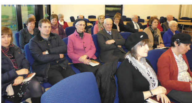
Faith Mission Service in Cleenish Centre

We were delighted to see so many attended the Carol Service held by the Faith Mission in the Centre on Sunday 6th December, it was especially good to welcome our local community. What a lovely way to see out 2015, and we eagerly anticipate what 2016 will bring as we continue to focus on Mission. Judging from the response of bookings in February and March the year ahead looks very busy, and so creating an opportunity for people to serve in many ways. If you feel you are called to serve in this way please contact the Centre by email: enquiries@cleenishcentre.com or tel: 028 66 349647.