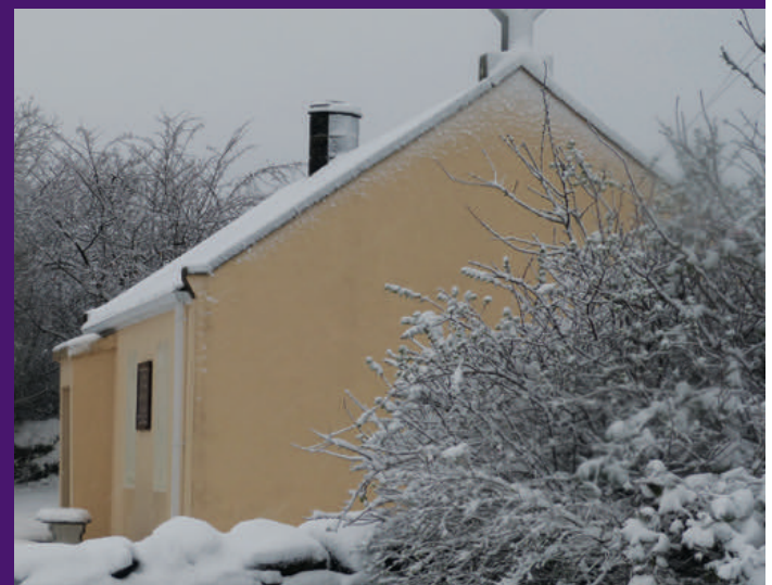
Winter at Coolbuck Church