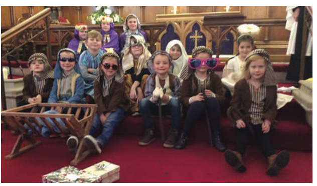
Sunday School Nativity Play

story of Christmas. The children were dressed up in the traditional garb and made the congregation smile with their readings and singing. Well done to them and their teachers - thank you! And yes, the sunglasses were part of the story!! (looking at the bright star over Bethlehem)