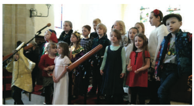
Away in a Manger: Members of the four Sunday schools

Thank you for support. The excellent result of \epsilon 6,090 is wonderful. Our sincere thanks to all who supported the Fayre and to all those who worked so hard preparing it and on the day.