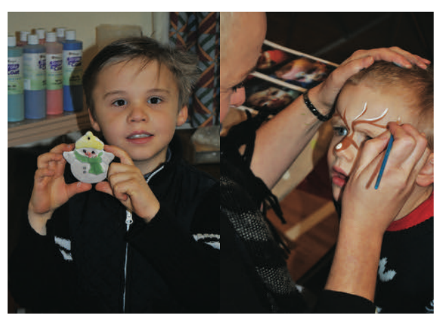
Fun at the Sunday School Christmas Party

Lisbellaw Parish website is not available to us for editing. Please see our Facebook page for up to date information on parish events.