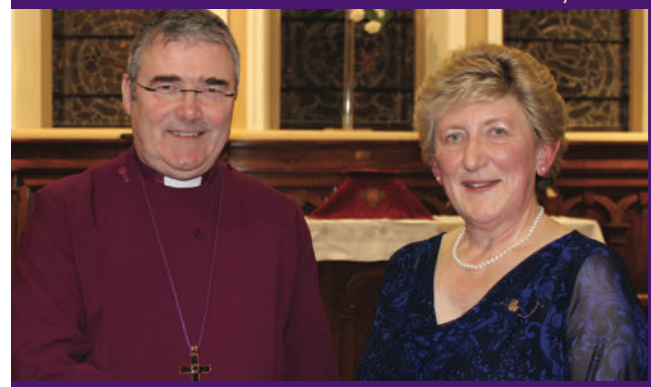
Commissioning of MU President