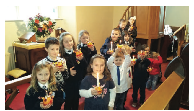
Children at the Christingle service in Drum

6th February at 8.00pm. Everyone is welcome and bring a friend.