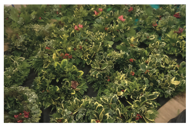
Floor of handmade wreaths

The model flyers are back in Ballycassidy Hall on Monday evening for the next few months. If you would like to learn more about the hobby come along after 7.00pm.