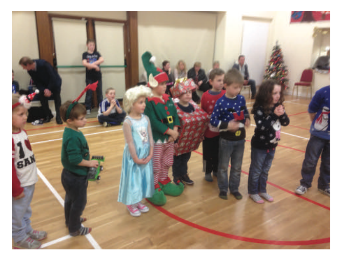
Judging children's Christmas outfits at the party in Dartrey

a big bag of presents. Thanks and appreciation to everyone who organized the evening and also for supplying and serving refreshments.