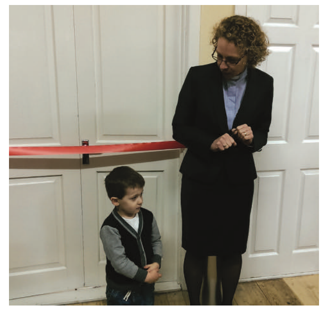
Ribbon cut by the youngest parishioner in Killeevan.

On the Fourth Sunday of Advent parishioners from all four parishes gathered in St Laebhan's Church Killeevan for an Advent celebration led by the children in the four Sunday Schools. We all enjoyed their Christmas plays they prepared, the poems and the many Carols. Our sincere thanks to all who participated and helped prepare this service.