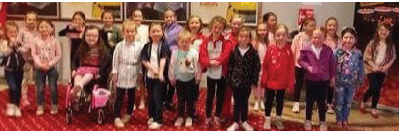
Lisbellaw Rainbows on their outing to see 'Boss Baby' in Enniskillen