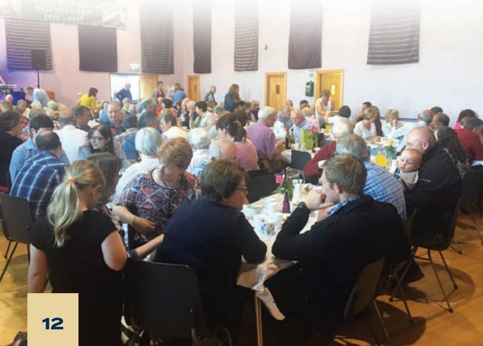
Mullaghduin Parish Barbeque