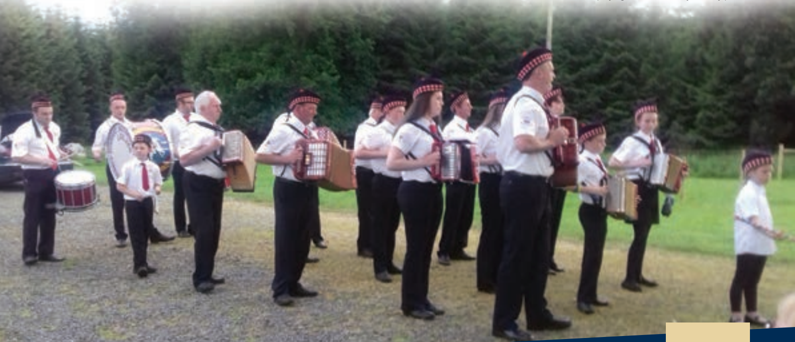
The band playing at the Rockcorry/Dartrey picnic.