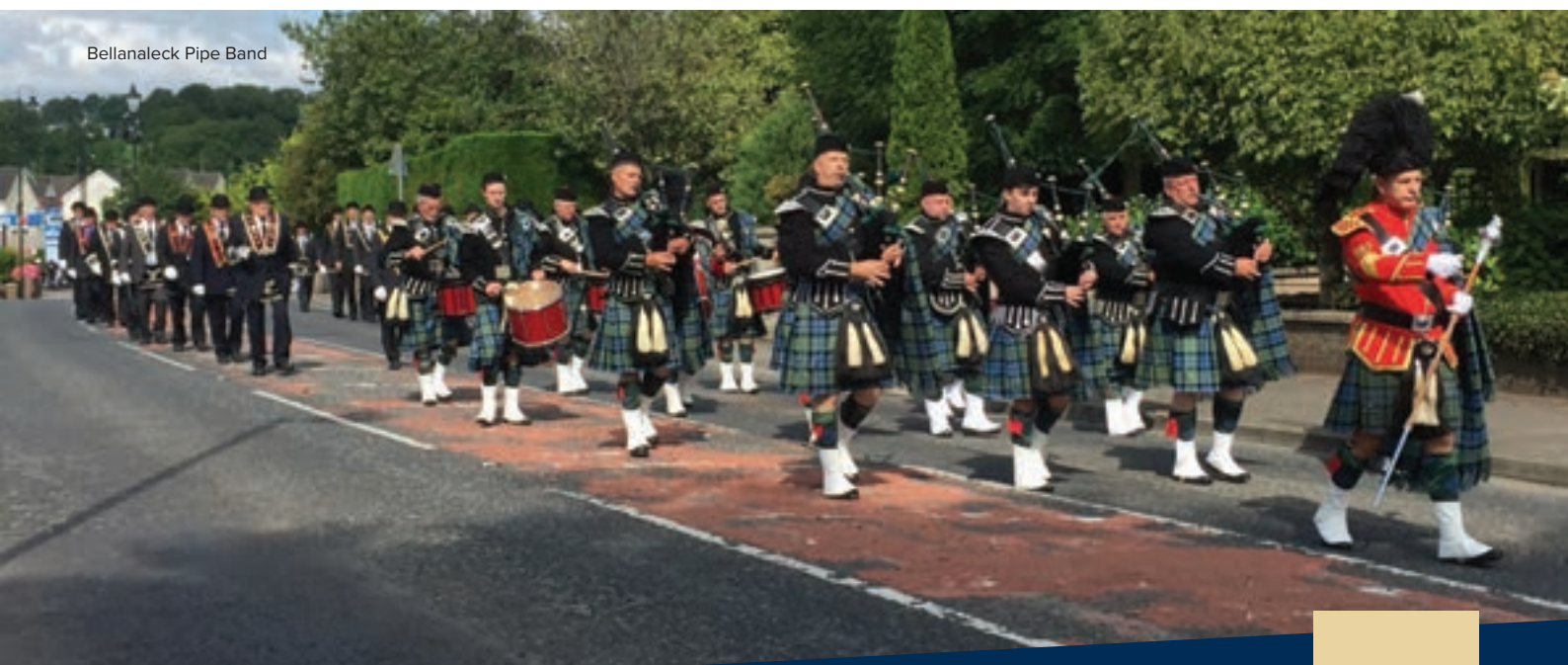
Bellanaleck Pipe Band

The Group recommence for the autumn period between 10am and 12noon, on Tuesday 19th September, in Cleenish Parish Hall. New members are welcome, and if further information is required