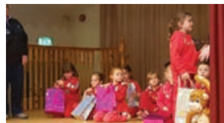
Lisbellaw Rainbows celebrate their fifteenth birthday!