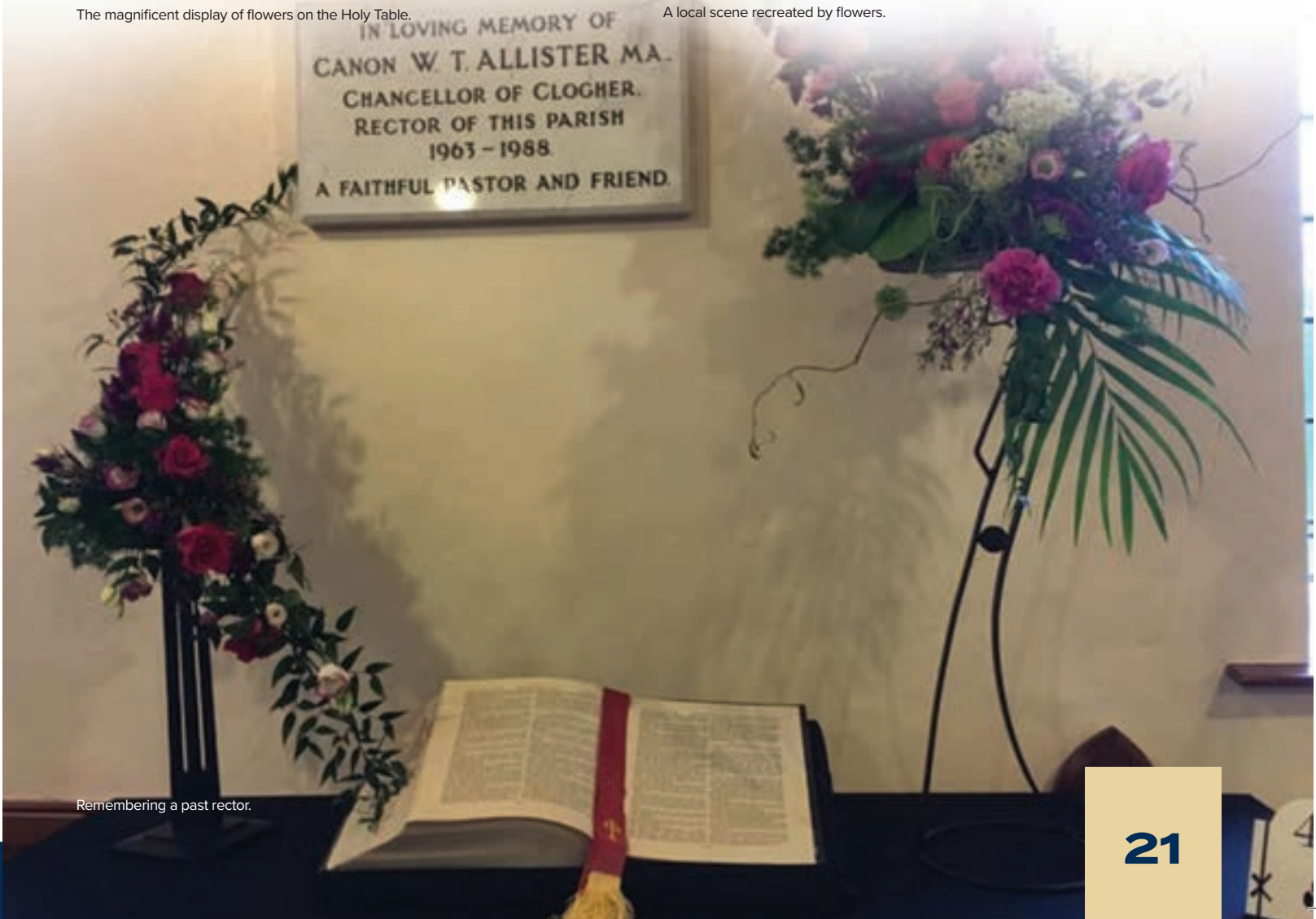
Remembering a past rector.