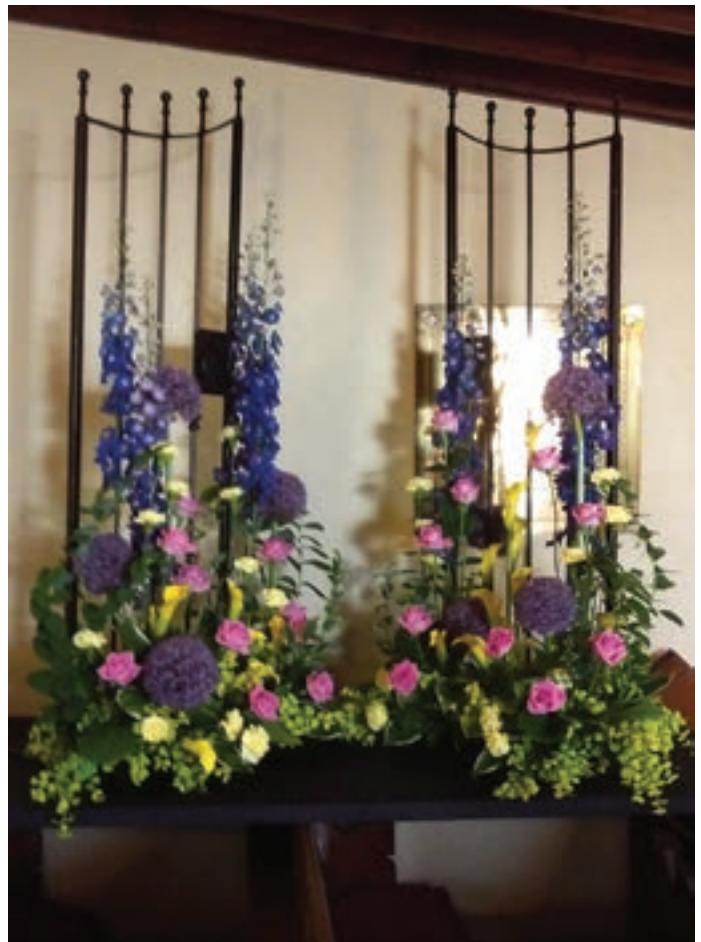
A floral display called Come to Worship in the nave of Trory Church.