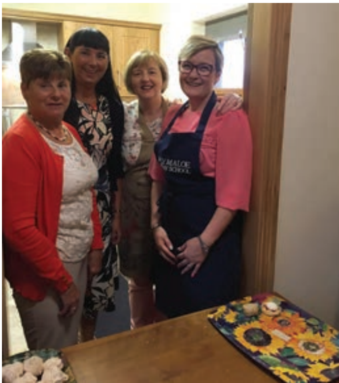
Some of the ladies who helped with the tea.