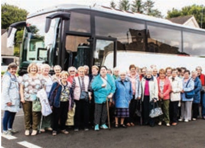
Friends in the Afternoon Summer Outing: Our members and their friends ready to board the bus for their cruise on Inishcruiser, Share Centre, Lisnaskea.

Thirty two members together with friends travelled by coach to the Share Centre, Lisnaskea, on Tuesday, 13th June 2017. They enjoyed two hours upon the Inishcruiser and listened to audio commentary detailing the interesting features about Upper Lough Erne: the history of Crom Castle, Crom Church and other old properties, the social life on the island and the abundance and variety of wild life. There were excellent onboard features on the cruiser. After the cruise, everyone enjoyed a delicious three course meal in the Share Restaurant and then returned to Ardess at 6.15pm.