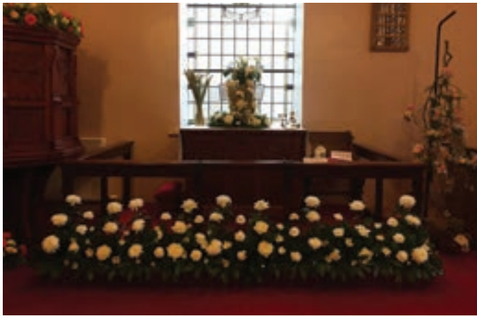
The magnificent display of flowers on the Holy Table.