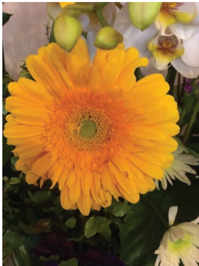
Colourful arrangements attracted a lot of visitors.