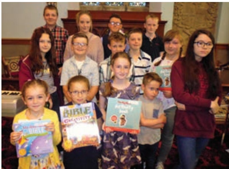
Members of Cleenish Sunday School during their final day of presentation.