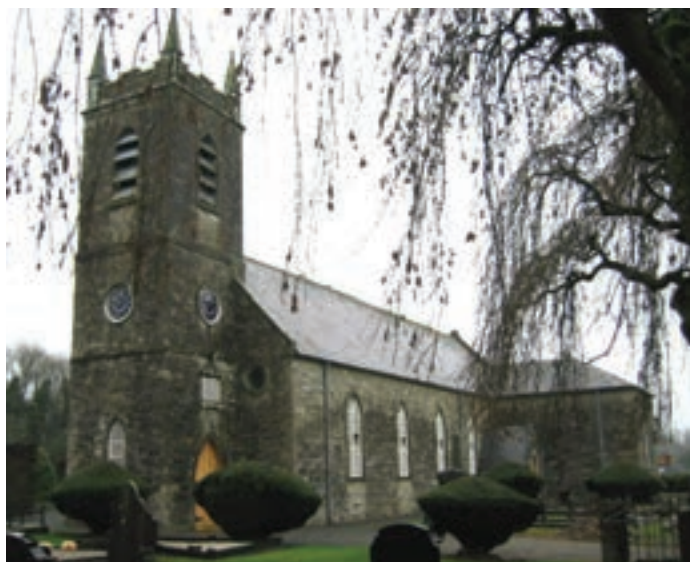
Tydavnet Parish Church