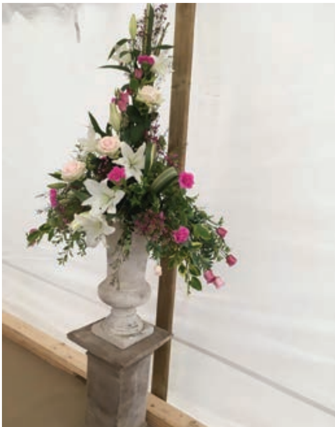
One of the terrific arrangements