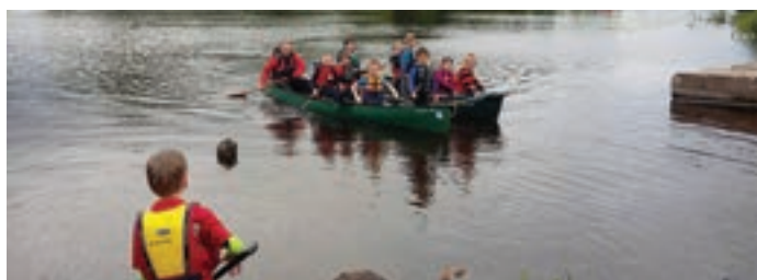
Rossorry Beavers on the water around Enniskillen.

The Beavers took to the water with a canoe trip around Enniskillen. A bit scary but a load of fun!