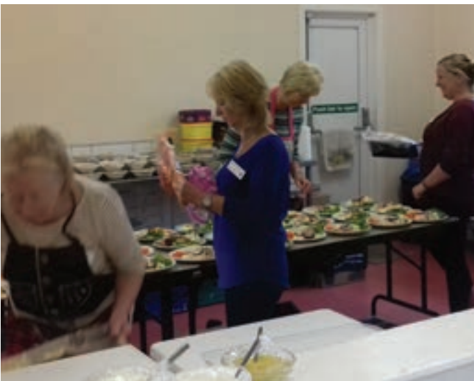
Ladies of The Parish preparing tasty treats for the many visitors to Trory Flower Festival.