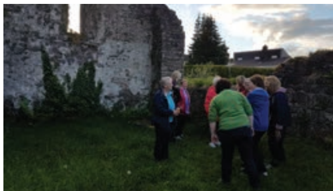
Walking Life Group having a laugh along the way.

The Following Life Groups are planned for July. If you haven't put your name down for a particular Life Group, you can still come along.