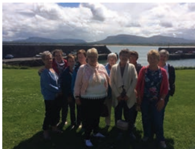
In-Stitches Summer Outing: The ladies enjoying the lovely weather at Mullaghmore.

On Saturday, 3rd June 2017, our In-Stitches ladies enjoyed a wonderful day perusing the craft supplies (and spending money!) at The Crafter's Basket shop in Cliffony. They had a coffee to rest from their shopping and a lovely walk along the view point at Mullaghmore and visiting the Yeats grave. They finished their day with a sumptuous meal at the Yeats Tavern.