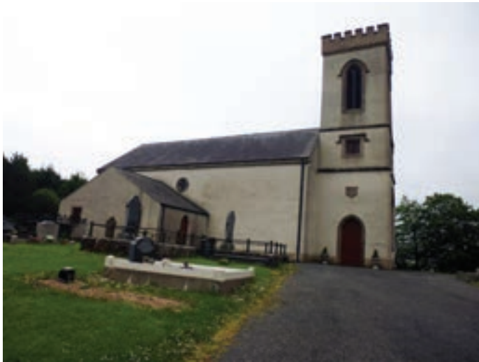
Mullaghduin Parish Church

Mullaghduin Parish Church is situated 4 miles from Letterbreen off the A4 Enniskillen to Belcoo road. The Parish of Mullaghduin was originally established as a rural curacy out of the greater parish of Cleenish in 1817, and a Church was constructed on the present site at that time. On Sunday 1st October members of the Parish celebrate the 200th Anniversary of the construction of the Church, by holding a special Anniversary Service, which will be followed by a Celebratory Lunch.