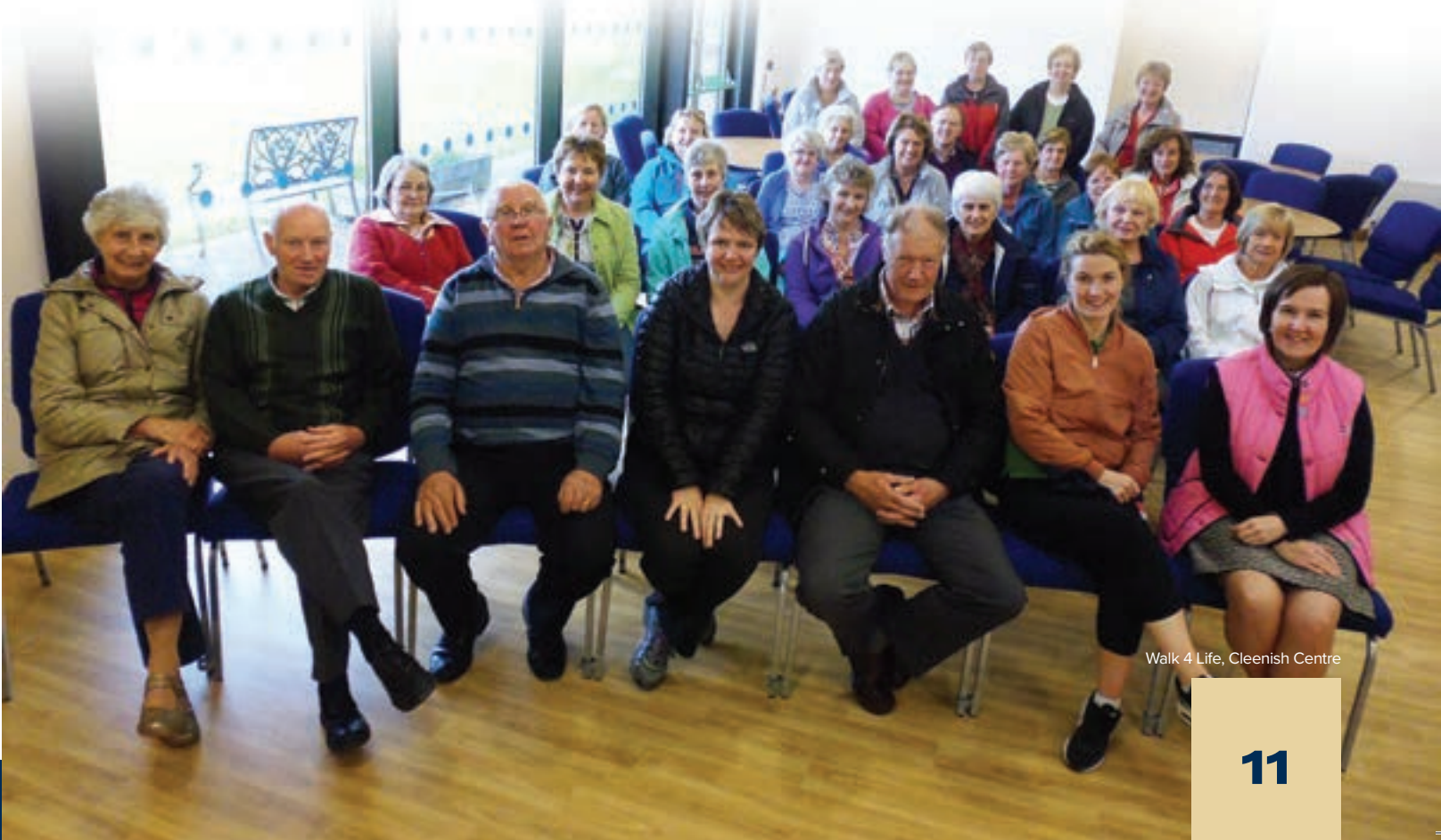
Walk 4 Life, Cleenish Centre