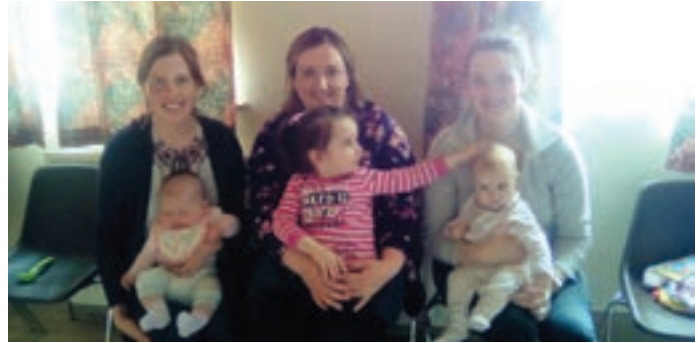
Some members of the Parent and Toddler group enjoying each others' company.