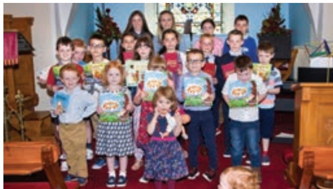
Aghadrumsee Sunday School