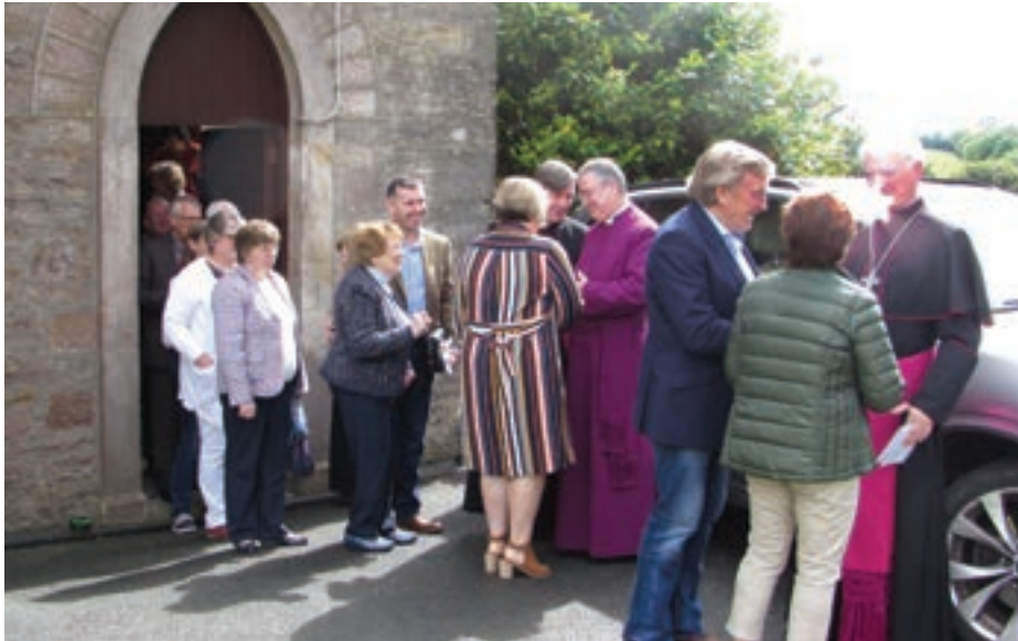
The congregation leaves St.Sillian's Church, Tyholland after the service.

The ecumenical prayer service for Pentecost customarily led by the two Bishops of Clogher, took place on Sunday, 4th June 2017 in St Sillian's Parish Church, an historic Church of Ireland church at Tyholland, Co. Monaghan.