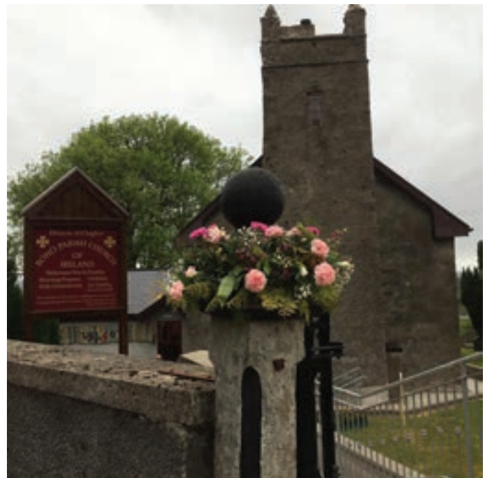
Boho church with a floral welcome to visitors