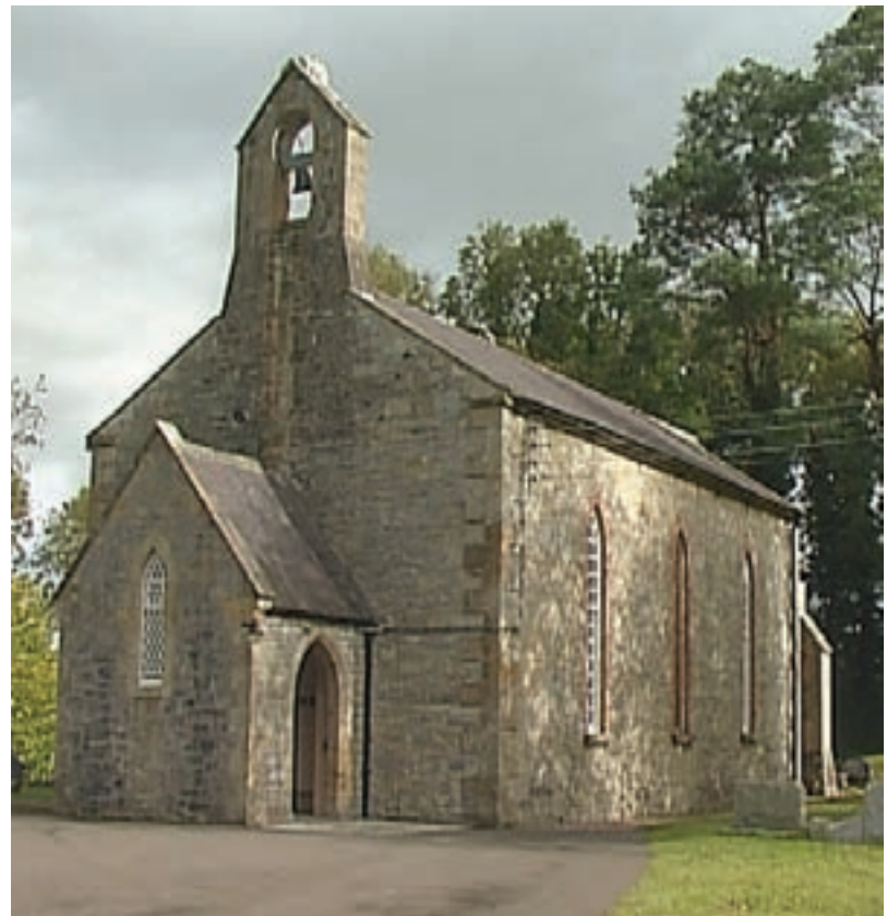
St. Michael's Parish Church, Derrybrusk