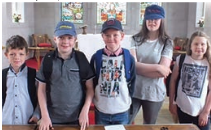
Slavin SS children at prizegiving.