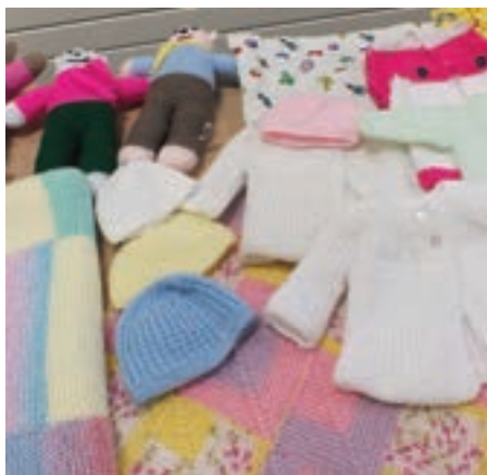
Items on the knitting and craft table were much admired.

Members continue to show their love through action and outreach.