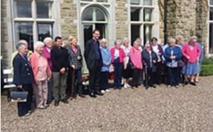
The Tuesday Club at Blessingbourne, Fivemiletown.