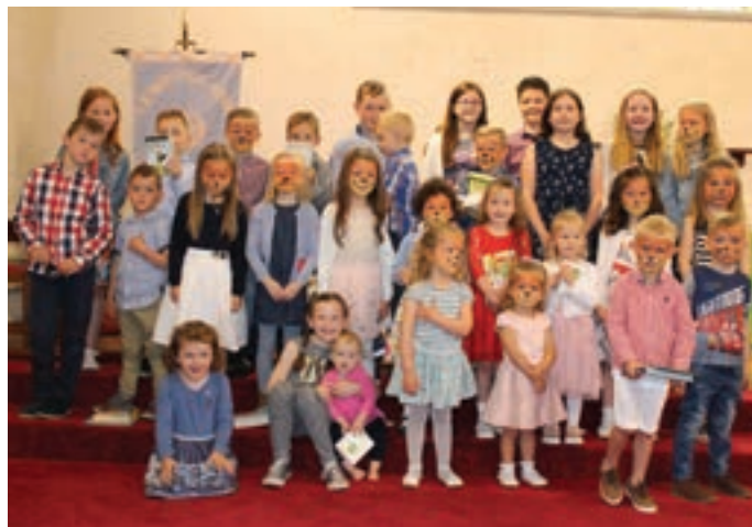
Tempo Sunday School.