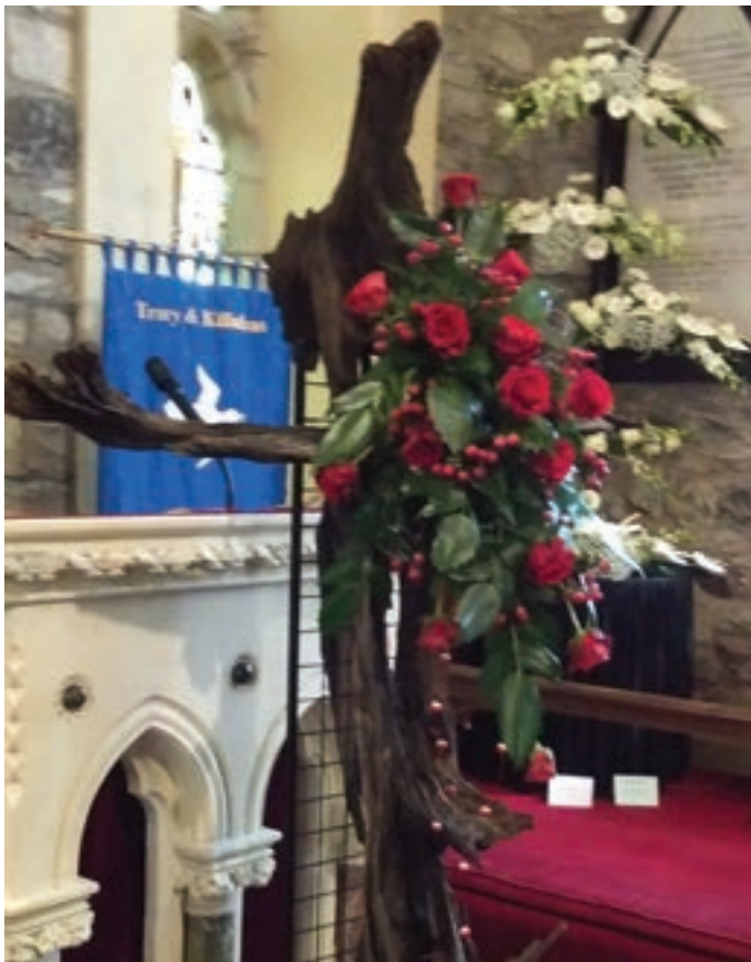
A bog wood floral display placed near the prayer desk.