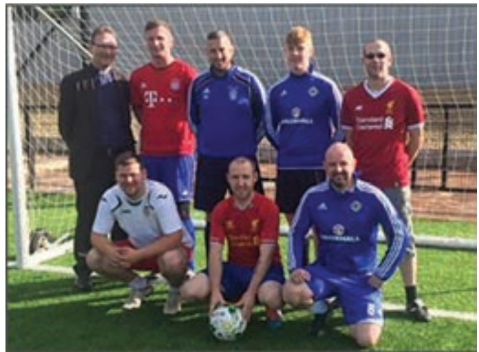
The Cathedral football team.

Pictured are the footballers who displayed great skill in the Barnabas Cup against very tough opposition at Ferney Park, Ballinamallard on Thursday evening, 15th June. Our thanks to all for their support.