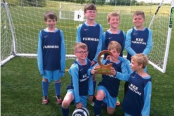
The Cub Scout team who won the NI City trophy at the finals in Cookstown on Saturday, 10th June.