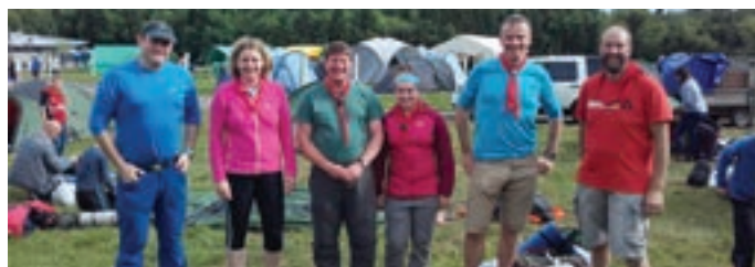
Cub leaders at their camp in Castle Saunderson.