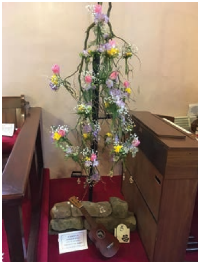
A musical arrangement.