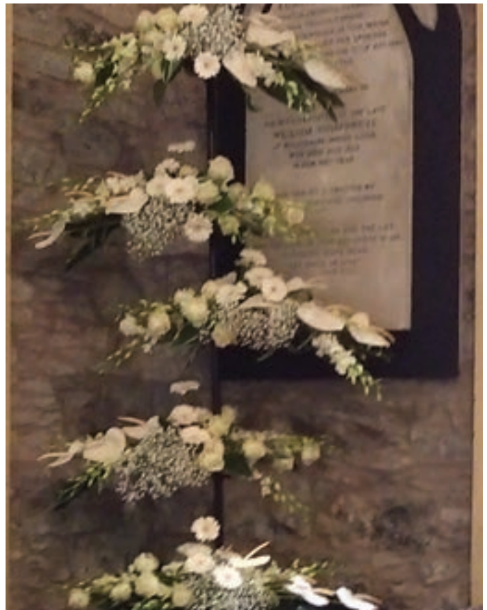
A floral display to enhance the beautiful Ascension window in St. Michael's Church, Trory.