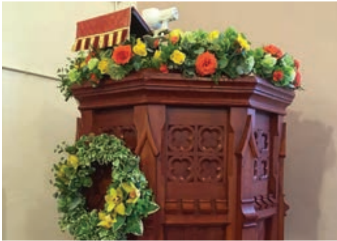
The pulpit is decorated for the Festival.