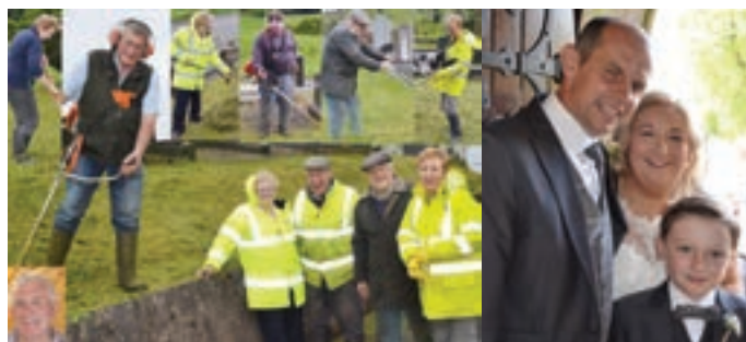
The grass cutting team.