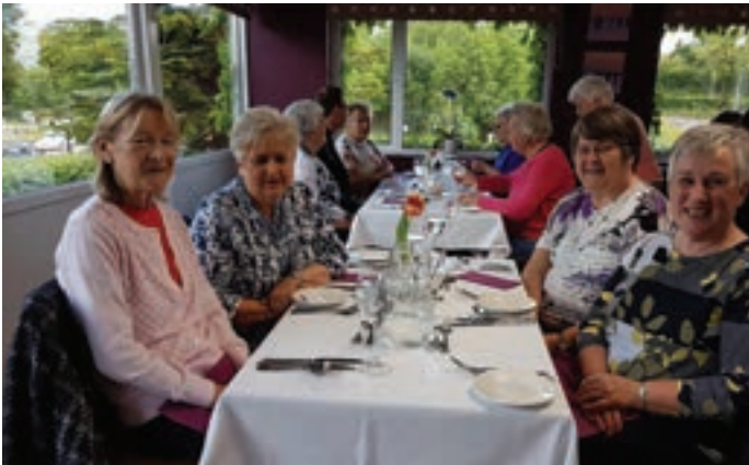
(Above and below) Members of the Tuesday Club at Carrybridge Hotel.

Its wonderful interior has many arts and crafts features. Our time regrettably came to an end too soon. We then headed for Carry Bridge Hotel. The Dean said grace before all enjoyed a lovely meal. We look forward to welcoming old and new members in September.