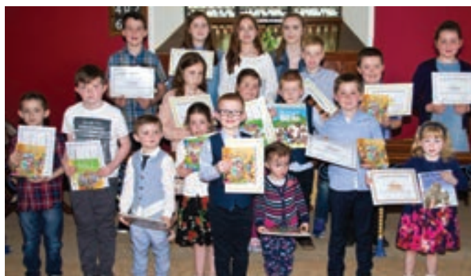
Clogh Sunday School on Children's Day, 11th June.