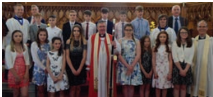
The confirmation candidates.