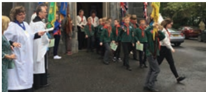
Young people on parade..

The Annual Youth Parade took place on Sunday 11th June, to mark the end of the year for our uniformed organisations and Sunday School. There was a large attendance and the organisations paraded to the church with flags. The service was a service of thanks for the work of the youth ministry in the parish and an opportunity to thank all those volunteers who willingly give so much time and effort to the young people throughout the year. Thank you each and everyone! Certificates were awarded to members of Sunday School, to mark their attendance and commitment.