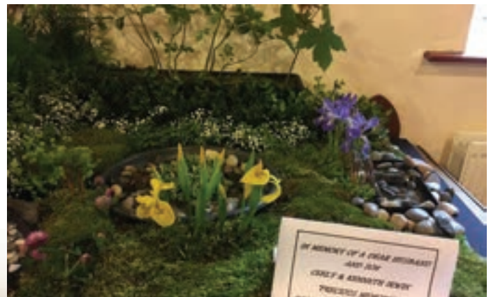
A local scene recreated by flowers.