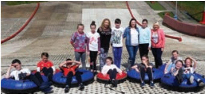
Junior Badminton Club take a trip snowboarding in Belfast.