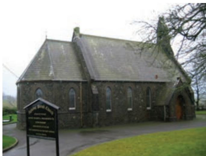
Aghabog Parish Church

Rockcorry church of Ireland N.S. proudly received their second An Taisce Green flag for Energy. The school has been working hard to save energy; turning off the lights, turning down the heating, switching off the electrical equipment on standby to name but a few. Rockcorry N.S. was very excited to be selected to perform at the Green Flag awards ceremony. The whole school sang our song "Hit the Switch".