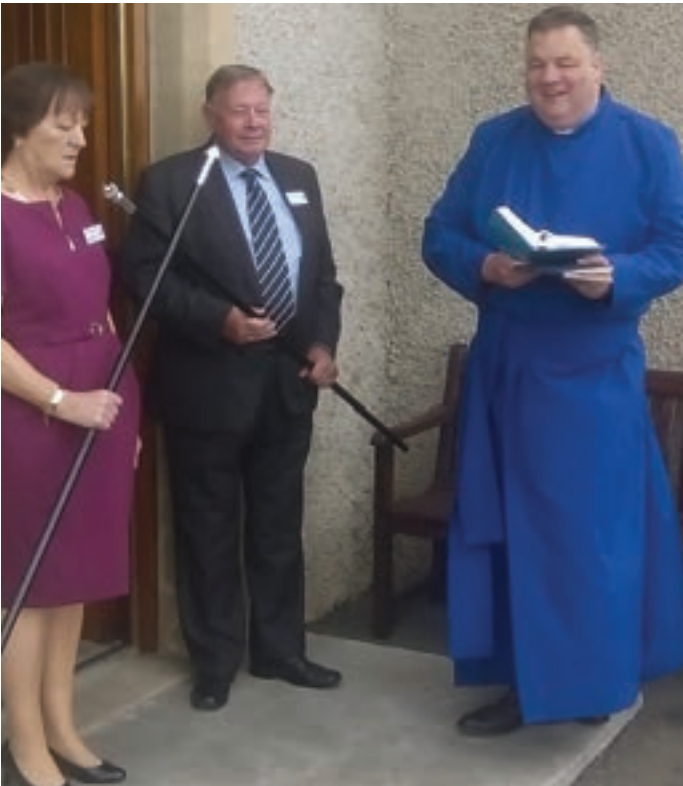
The Rector and Churchwardens opening Trory Flower Festival.

Dear Parishioners, Trory Flower Festival