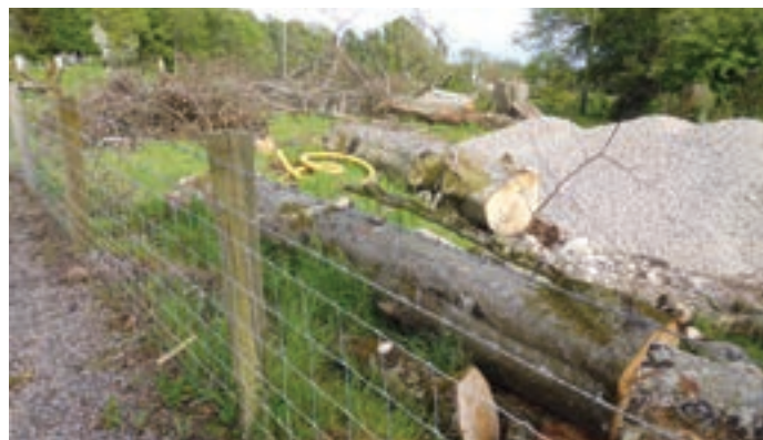
Damaged tree in Rectory Grounds.

As a result of storm "Doris", many trees and branches were damaged around the entire community. One such very large tree fell within Cleenish Rectory grounds. The damaged fence between the grounds, and a nearby bungalow has now been re-erected, and large sections of the tree is now cut up. Sincere thanks are due to volunteers Ossie Clements, Balfour Hoey, Derrick Irvine, Derrick Graham, and any other helpers who assisted in clearing the tree and Rectory grounds.