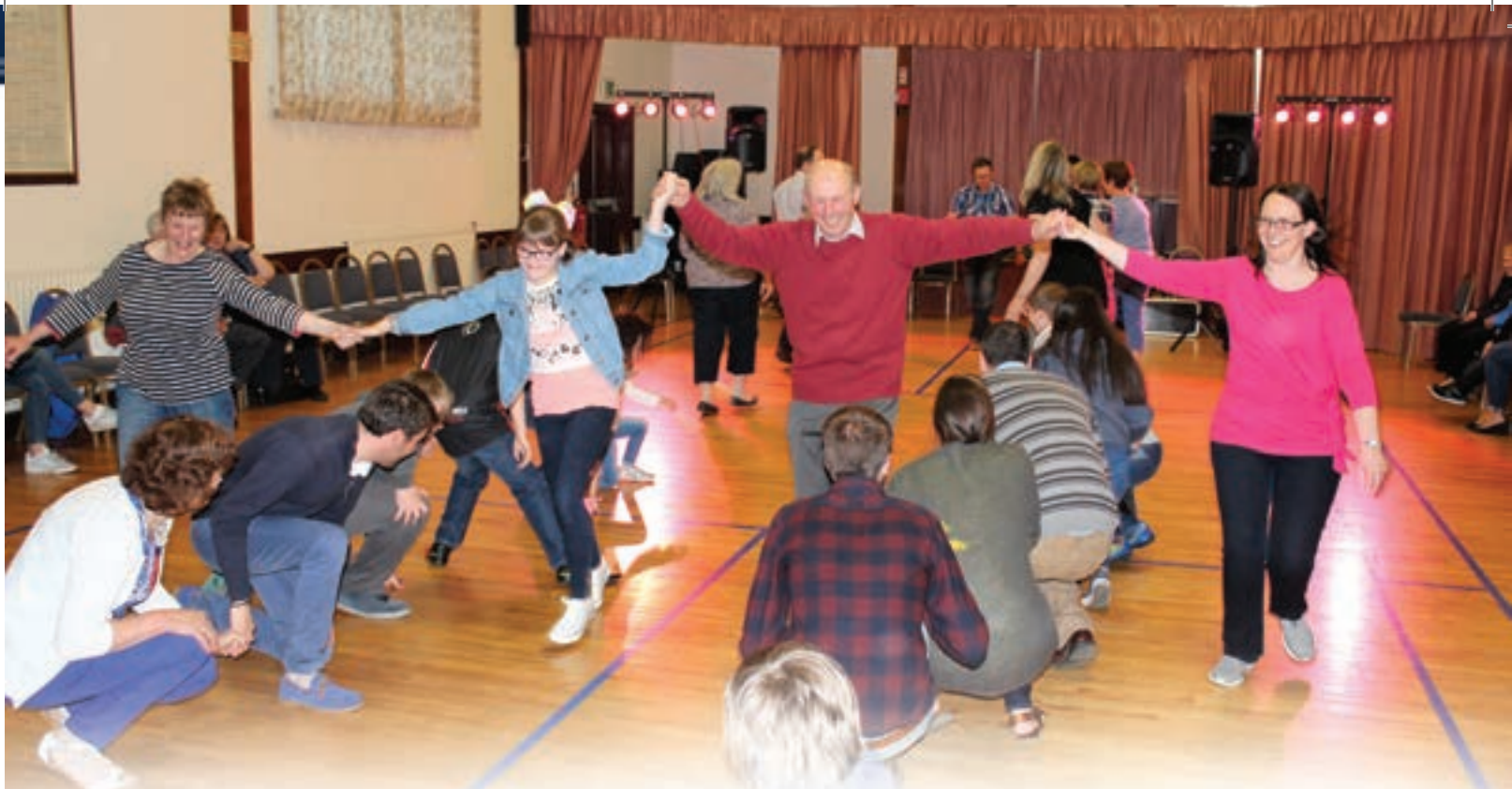
Group Family Parish Day