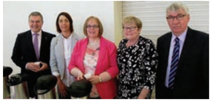
Some of the parishioners enjoying the new facilities at the Cathedral Hall

The day we have all been looking forward to is close at hand! The newly extended and renovated Cathedral Hall will be opened officially on Wednesday, 10th May at 7.30pm. An invitation to be present on this most important occasion is extended to all.