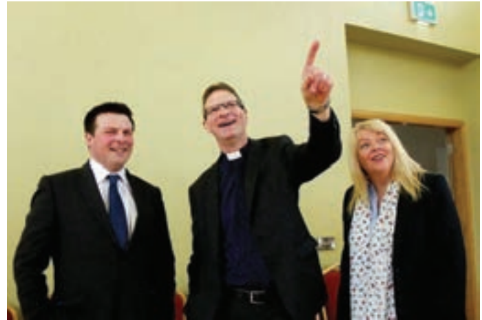
The Dean showing some of the features of the newly refurbished hall.

Many will already have had an opportunity of seeing the excellent facilities before everything has been fully completed. By the time of the official opening takes place everything will be complete. The main hall facilities have been modified and completed to the highest