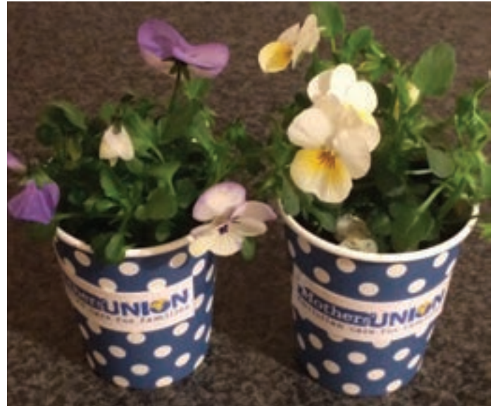
M.U., Potted Flower

Mothers' Union members marked Mothering Sunday during the Family Service. Sunday School children assisted the Branch Leader in distributing a potted flower to all women in the congregation to mark the event. Flowers were also distributed to in-door members in advance of the Service.