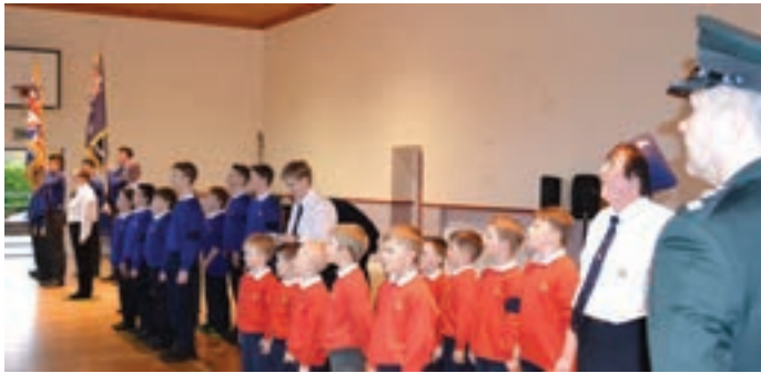
The BB display