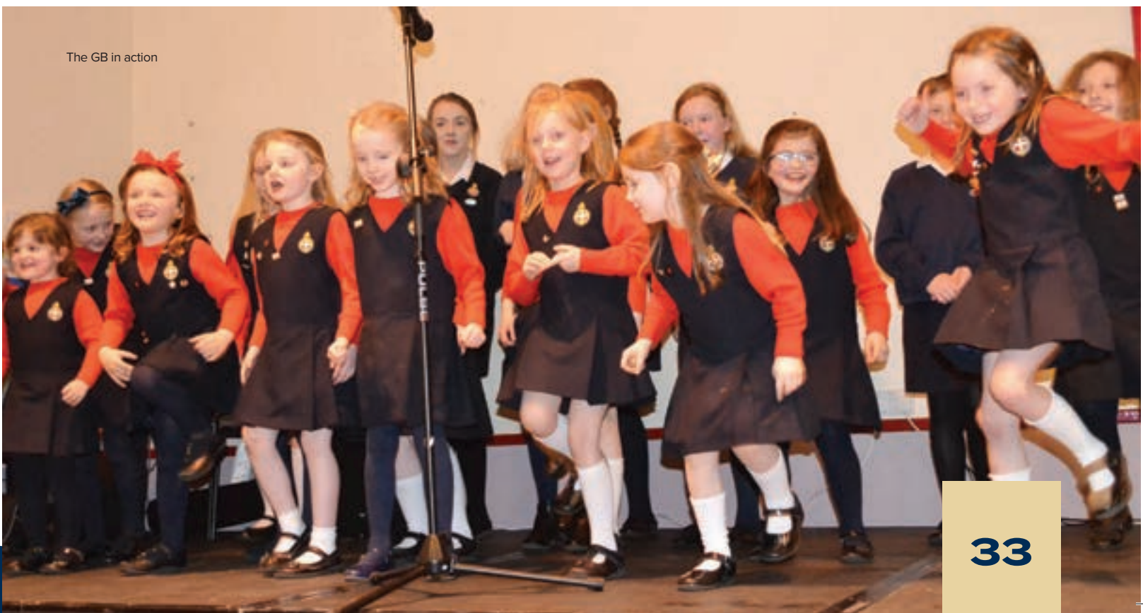
The GB in action

Girls' Brigade held their Annual Dinner/Display on March 25th and Boys' Brigade their Parents' Night/Display on March 31st – see our pics!