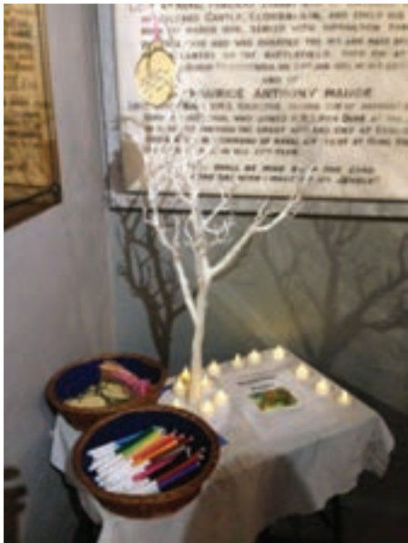
The Xplore prayer tree