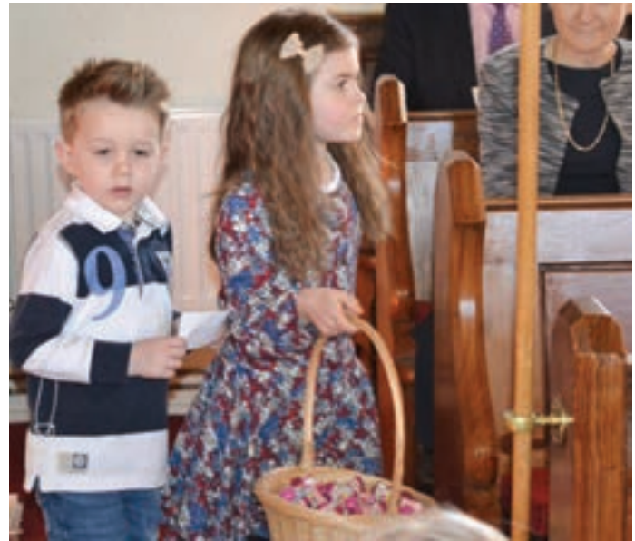
Distributing Love Hearts