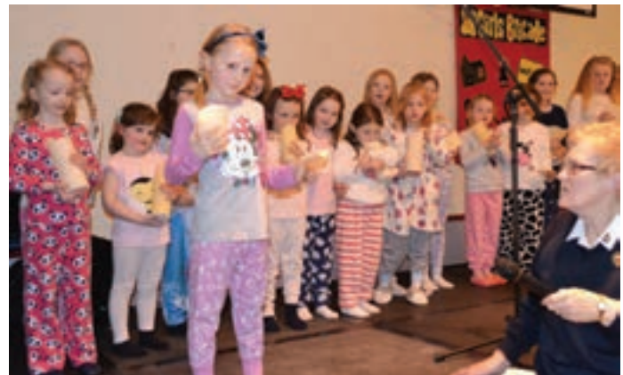
The GB performance of 10 little candles

Girls' Brigade held their Annual Dinner/Display on March 25th and Boys' Brigade their Parents' Night/Display on March 31st – see our pics!