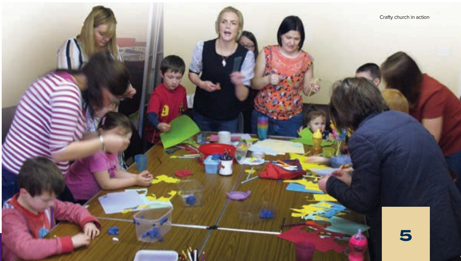
Crafty church in action

Our next Crafty Church will take place on Saturday, 20th May from 3pm – 4.30pm in Aghadrumsee Old School, this new group is open to all children aged 2 – 7 years and is filled with craft activities, games and songs based on the Bible story of the day. All children must be accompanied by a responsible adult.