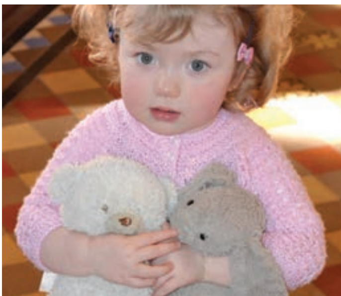
Soft toys help spread love