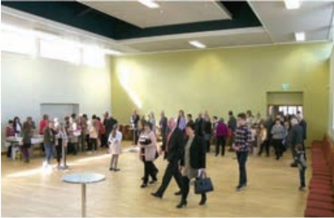
Parishioners getting a first look around the newly refurbished Cathedral Hall