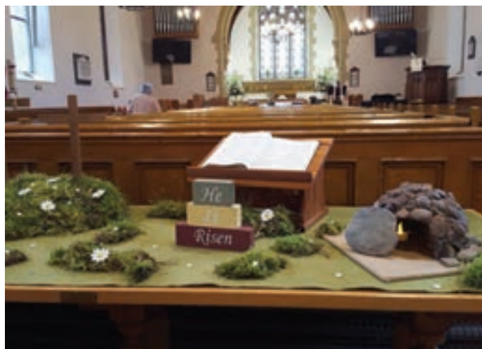
The Easter Garden in Magheracross Parish Church

On 9th May, our GFS will be holding their AGM and Parents' Night in the Archdale Hall. This is usually an entertaining evening with supper.