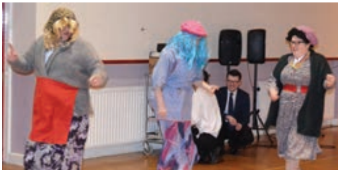
The BB leaders entertain