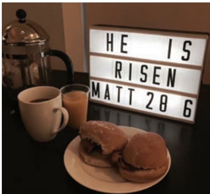
Breakfast in the Cleenish Centre