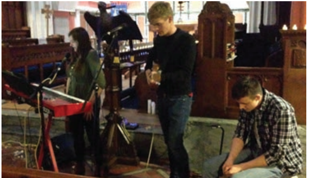
The Xplore Band

Safe to say that the steps to the chancel of the Cathedral were festooned with shaving foam and “Wotsits” by the time we were finished laughing and having fun! But it was so good to see our young people totally at home in one of our main church buildings in the diocese. Maybe it was apt that the halls were not ready for us in time! All fully relaxed and comfortable with our environment, Criostoir then thanked Laura