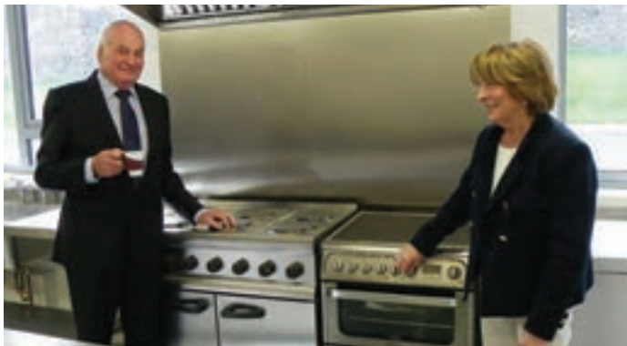
Trying out the new kitchen facilities.

standards. In addition to the main rooms which include the Hilliard Room, The Iona Room, The Enniskillen Room and The Devenish Room, there is a new stainless steel kitchen which should meet the most demanding catering needs for years to come. A major new addition is The Upper Room which has been created above the former stage area. The new Diocesan suite of offices, which are accessed from the lower car park area, have their own separate entrance facing Hall's Lane.