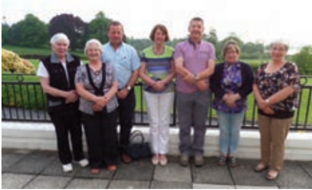
MU trip to Mullingar

away in Mullingar, Galway and Dublin, organised by Innishmaccsaint Mothers' Union. Beautiful weather made it a very enjoyable trip, with good company and a lovely hotel.