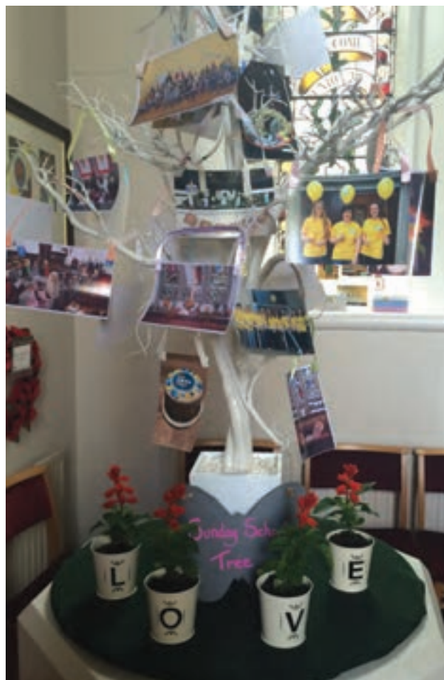
Our Sunday School family tree

The annual end of term Sunday School service was held in Drumkeeran on Sunday 29th May. The children did a variety of readings, poems and prayers. It was great to have so many children taking part. I hope they enjoyed the little gifts received at the end of the service.