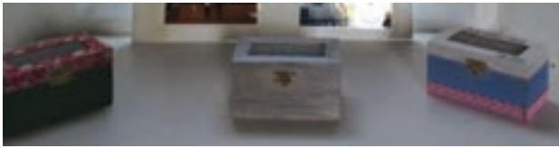
Kids promise boxes