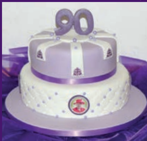
Aghalurcher's Celebration Cake