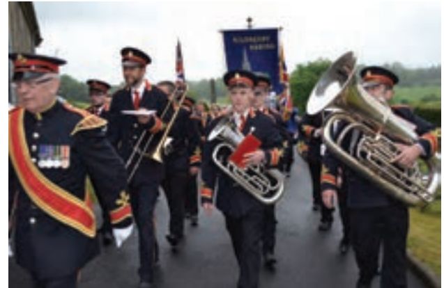
Kilskeery Silver Band arriving at church for Service

Saturday, 11th June saw us gather at QEII Primary School for a Community Celebration of the Queen's 90th Birthday where a great number of adults and children enjoyed live music, afternoon tea, a vintage car display, games, bouncy castle and a variety of side-shows.