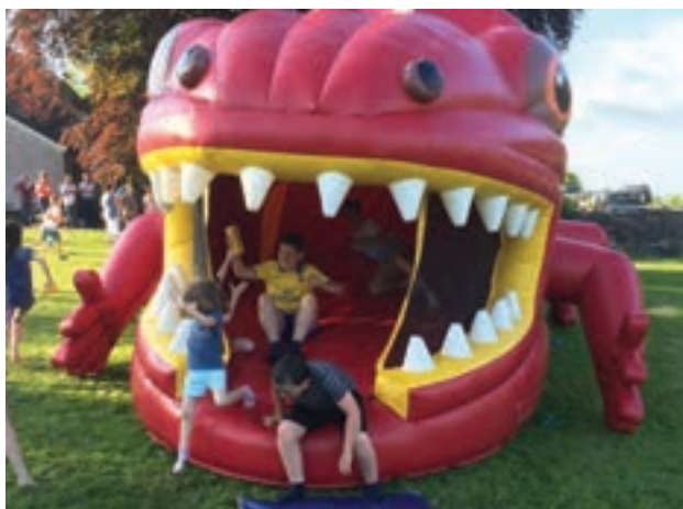
Fun at the Youth BBQ

This was kindly organised by the Scouts and Guides and was mighty craic! There was a big crowd on a beautiful summer evening and the event marked the end of another successful year in Rossorry of the Youth Ministry. The fellowship and the fun were a lovely way to ensure that our young people feel they are the heart and future of our parish.