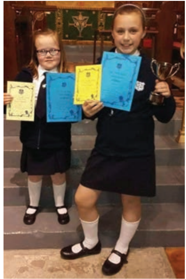
GFS members with their awards