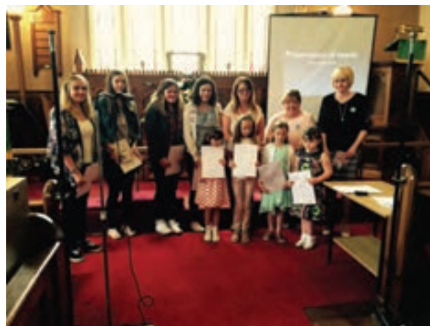
GFS leaders and members

Thank you to all who have taught in Sunday School throughout the year, and to the parents who support the youth organisations. Thank you also to those who helped to prepare, serve and wash up after the delicious lunch, raising funds for the CMS Ireland project 'The Meeting Place'.