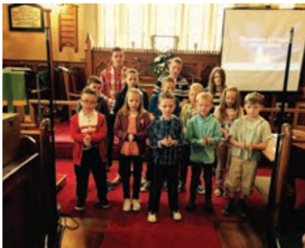
Sunday School children

Children's Day in Aghavea was on Sunday 19th June, with GFS and Sunday School awards, and a Parish Lunch in the Church Hall after the service.