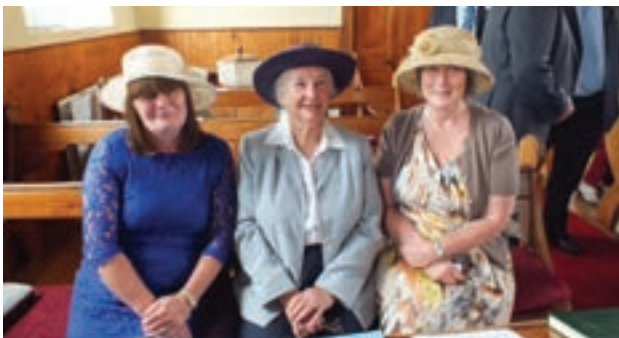
Slavin & Belleek ladies with their hats on for the Queen's birthday