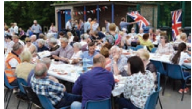
Kilskeery 'Street' Party