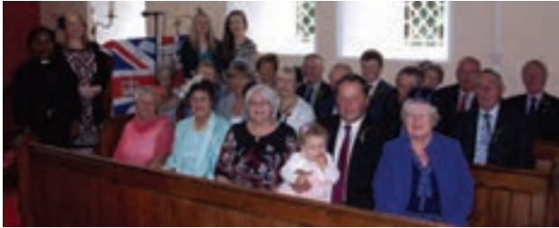
Some of the parishioners at Kiltyclogher celebrating the Queen's birthday

of Queen Elizabeth II. The ladies all wore hats or fascinators and the men wore flowers in their buttonholes.