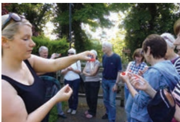
Part of the Group at the Wildflower Walk