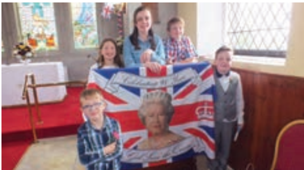
Some of the Slavin & Belleek Sunday School children enjoying the Queen's birthday celebrations

The rector prayed for her and gave thanks for her long life and her reign over our country. The congregations sang Happy Birthday and the National Anthem. Refreshments were served after with cupcakes suitably adorned with Union Flags for the celebration. Thanks to everyone who helped with all the arrangements for this.