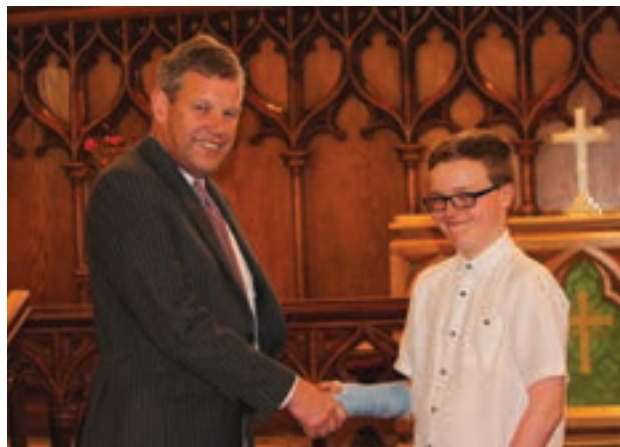
Making a Presentation to The Parish Building Fund