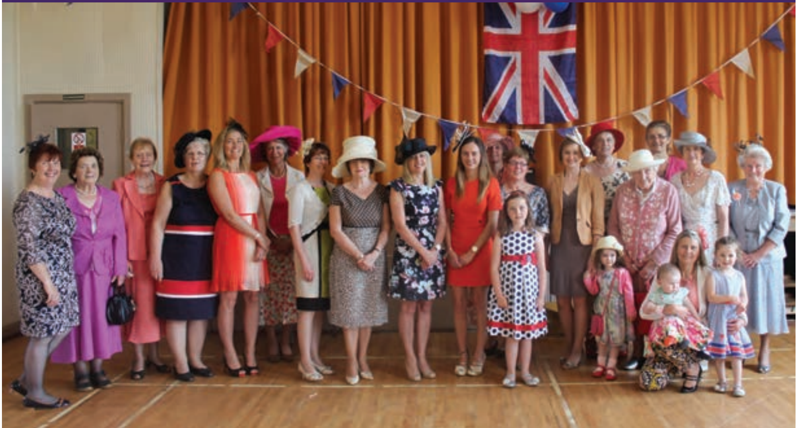
Celebrating the Queen's 90th at Derryvullen South