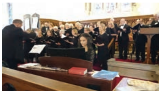
Fermanagh Choral Society in Rossorry

This concert, kindly provided by The Fermanagh Choral Society, took place in the Church on Tuesday evening the 7th June 2016 at 7.30pm. It was wonderful to fill the church with a large choir, as part of our thanksgiving for 175 years of worship on this site. A very large crowd attended and was treated to a wonderful programme of music and story. The fellowship and refreshments made for a memorable evening for our parish and the many visitors.