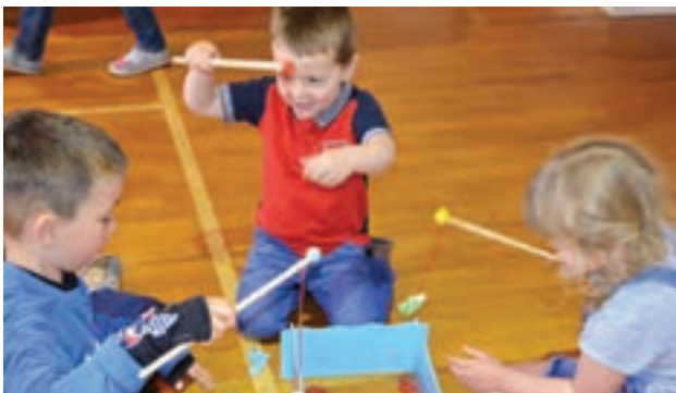
Messy Kids Gone Fishing

Boys Brigade Fund Raising Event with 'B Special Historical Platoon' – 4th November (Tickets for both of the above will be available shortly)