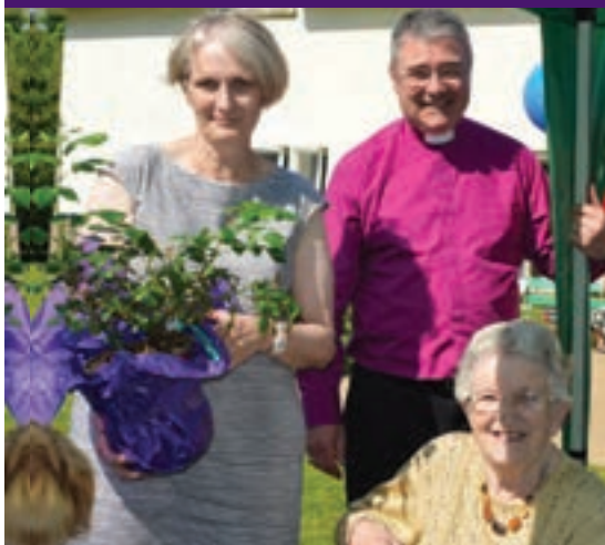
MU Indoor Members Tea Party