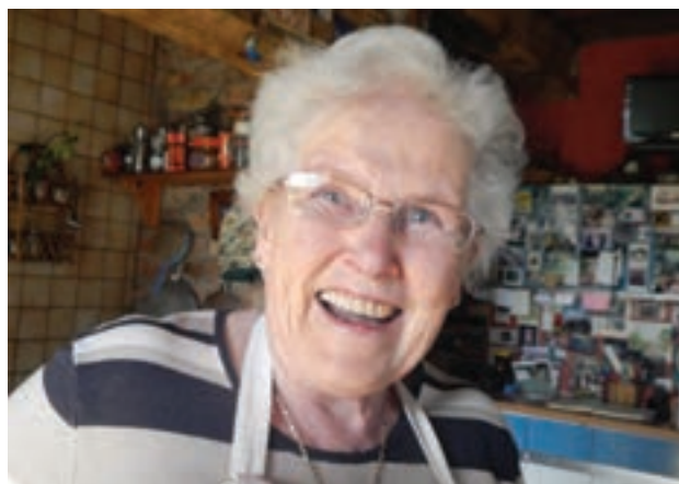
We were all met with a warm smile and delicious treats at the coffee-morning