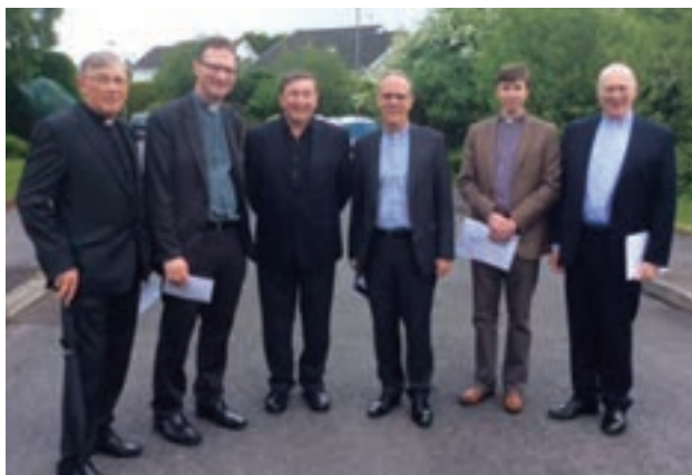
Clergy at the outdoor service at Old Rossorry

We held an event to connect our congregation with the ancient site of St Fanchea's Church at Old Rossorry which was the original Rossorry Church. The Service was held at Old Rossorry on Sunday 29th May at 3pm. In spite of a thunderstorm – there was a good crowd who enjoyed the fellowship and the chance to learn about the history of Christianity in Fermanagh and how Rossorry was one of the earliest christian communities in this area. We were delighted to welcome clergy and parishioners from our sister christian churches in Enniskillen.