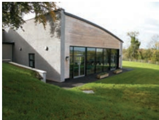
Frontal view of Cleenish Centre

The Centre with its many outdoor attractions is busy taking bookings for the summer period. It is situated in private grounds overlooking the boating marinas along Lough Erne. Facilities are available at the Centre, for outdoor football, with the Courtyard very suitable for BBQ's.