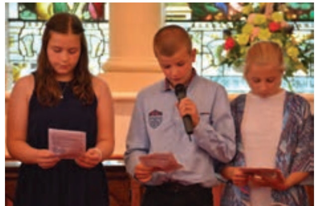
Children taking part in the prize giving service