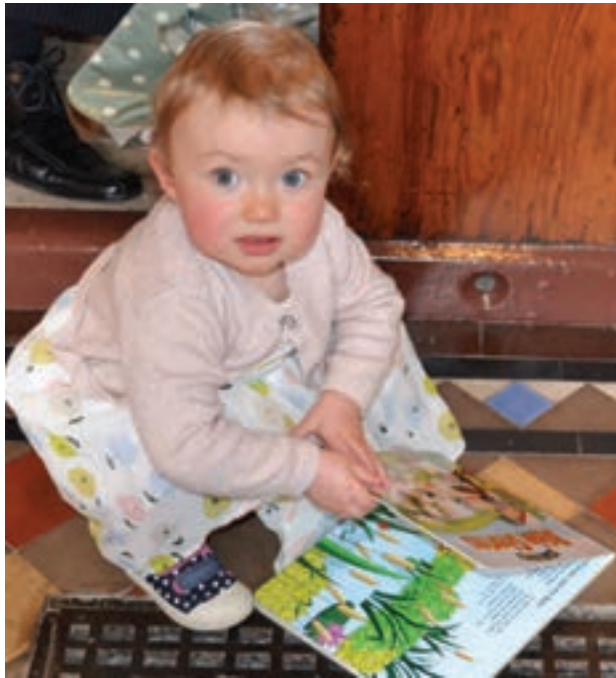
Kilskeery Sunday School Prize Giving