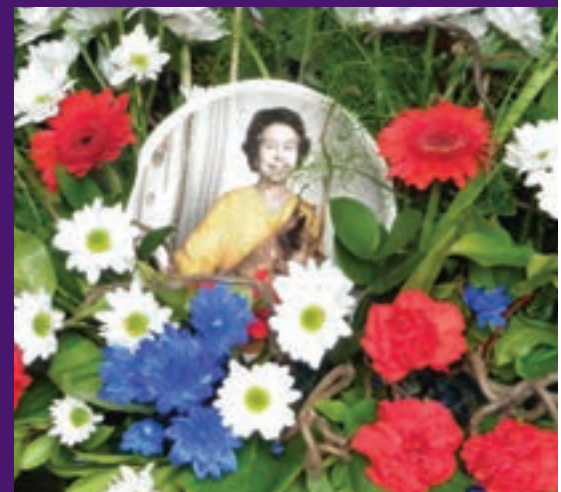
Flower Display at Garvary