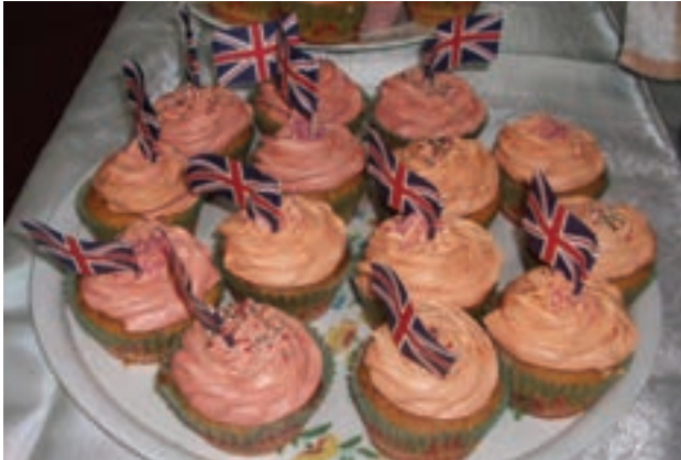
The cupcakes enjoyed by Kiltyclogher parishioners

The rector prayed for her and gave thanks for her long life and her reign over our country. The congregations sang Happy Birthday and the National Anthem. Refreshments were served after with cupcakes suitably adorned with Union Flags for the celebration. Thanks to everyone who helped with all the arrangements for this.