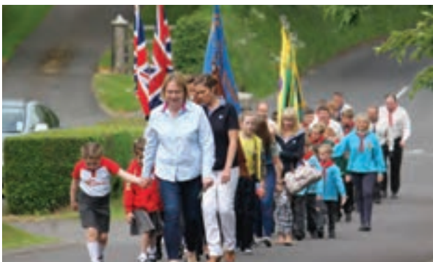
Children parading to Church

On Sunday 5th June, the uniformed organisations and the Sunday School children paraded to church to mark the end of their year. The children and young people read the Lessons and the Prayers.