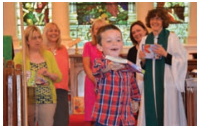
Some one is delighted with their Sunday School prize!

Thank you to members of the Mothers' Union who celebrated 140 years of their existence and the birthday of their patron, Queen Elizabeth II, with a refreshing cup of tea and refreshments before a special Service of the Word to celebrate both on Sunday 12th June. Sunday School prizes were also given out during this service.