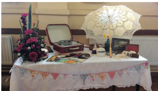
Display of memorabilia at Coffee and Flowers Morning

On Saturday 7th May there was a Coffee and Flowers morning in the Parish Hall. The Hall was packed to capacity and the audience were treated to a flower arranging display and a lovely spread of morning coffee and freshly baked goodies. Delighted to report that £1,450 was raised for The Church Repair Fund.