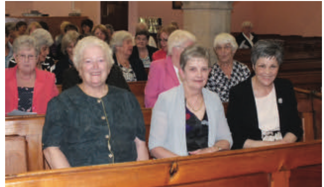
Some members of the congregation in Magheraculmoney