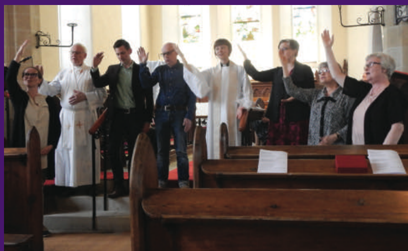
Visitors from Lackalänga Parish, Sweden