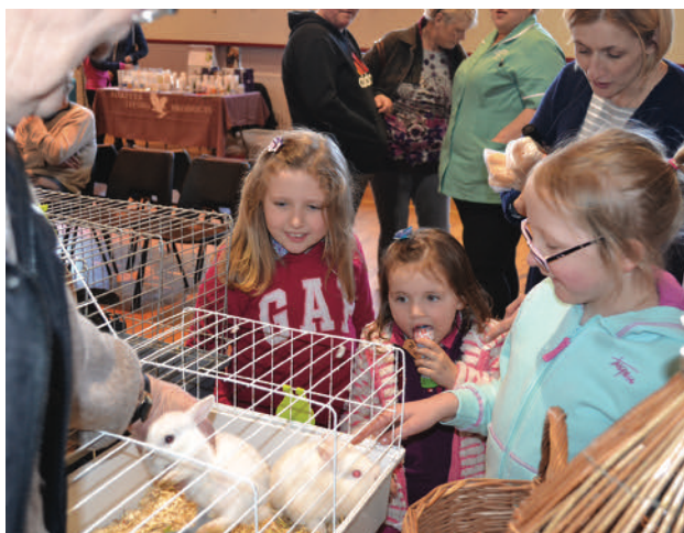
Mini Auction & Coffee Afternoon at Kilskeery