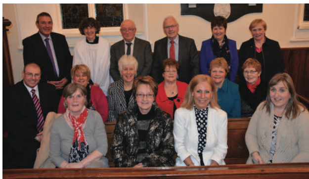
Members of the choir at the recent 'Evening of Worship