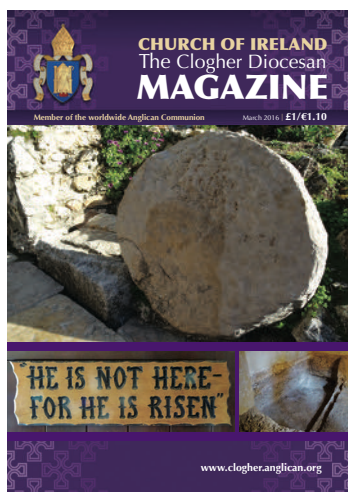
March Magazine which was submitted to competition