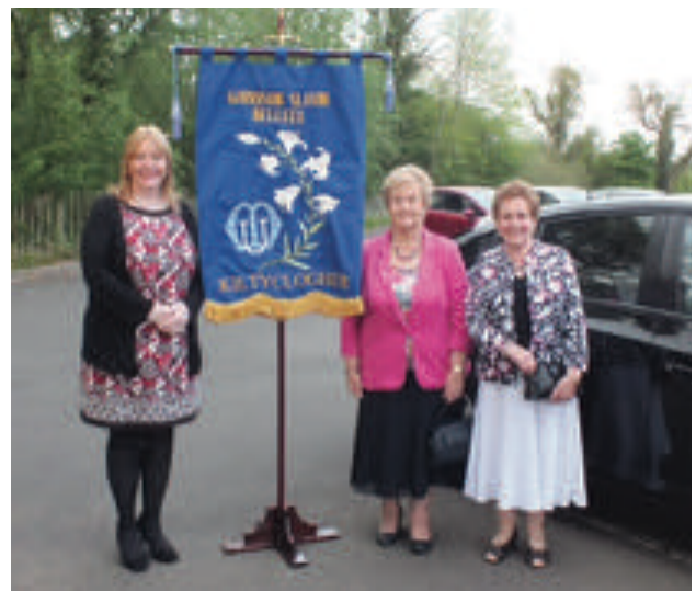
Members of Garrison Branch arriving with their Banner