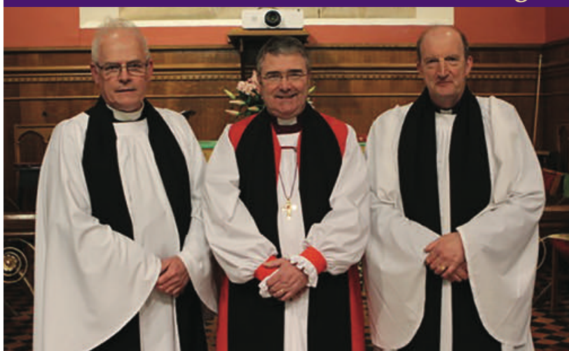
Canon Skuce Instituted to Inishmacsaint