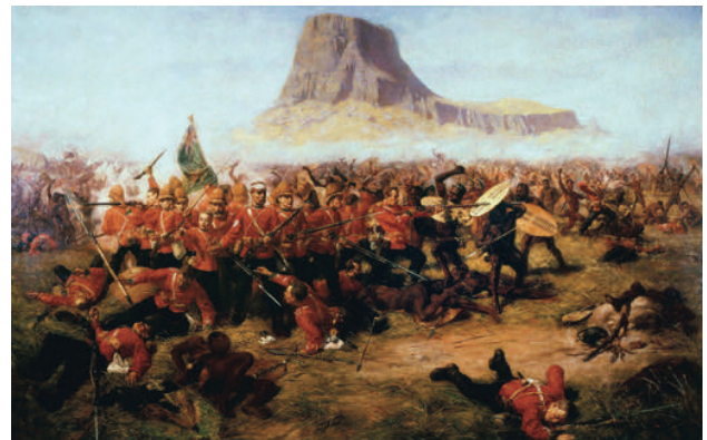
A scene from the Battle of Isandlwana

Having been fortunate enough to have visited the battlefields of Zululand, South Africa, I have developed an interest in the soldiers who died there during the war of 1879 and have spent the last few years locating and recording memorials which commemorate them. Therefore, I was wondering whether anybody has any knowledge of such examples within their local parish churches or cemeteries.