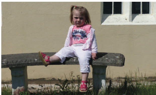
Youngest parishioner sitting in the sun before the service