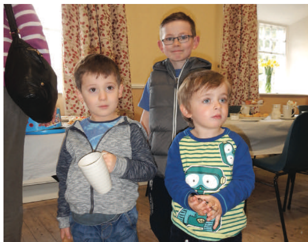
Three gentlemen opening the Sale of Works

Killeevan Hall was well attended as parishioners of all ages welcomed visitors and friends to the Parish and Missionary Sale. The hall was filled with homemade cakes, plants and books. It was a wonderful and warm atmosphere in the hall and everyone seemed to enjoy their tea and coffee, and not least the opportunity to relax in the company of friends. Sincere thanks to all of you who supported Killeevan Parish and to all who worked so hard preparing for and on the day of the sale.