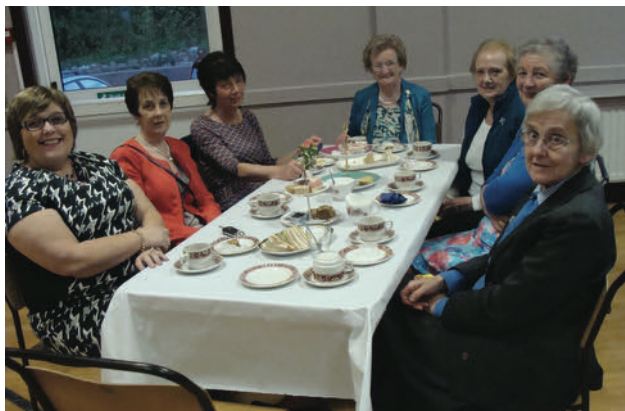
Ladies enjoying supper following the Service

Jesus. He urged MU members to pray more for themselves, their families and congregations. He encouraged members to use the Book of Common Prayer to help them to pray.