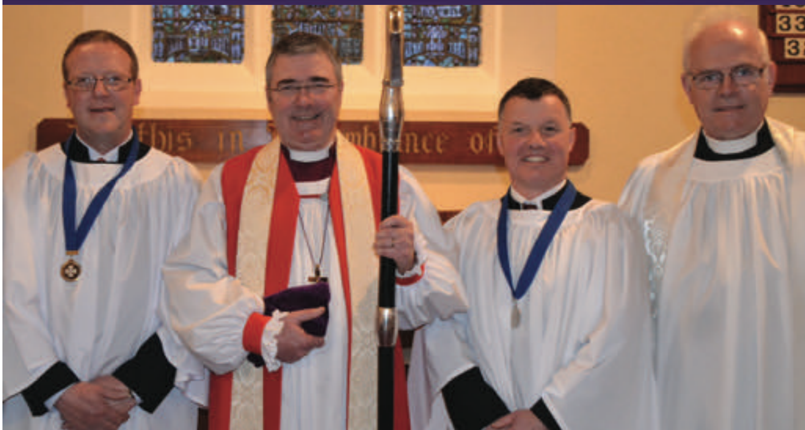
Commissioning of new Parish Readers