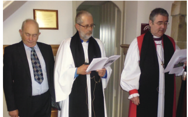
The Bishop blesses the new extension