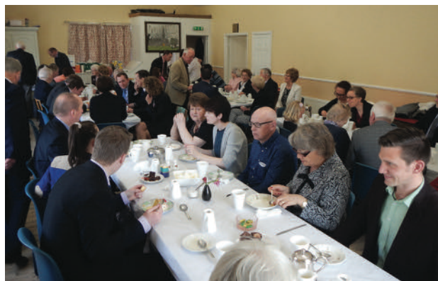
Delicious Sunday Lunch!