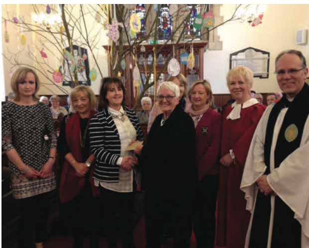
Presentation of cheque to Cancer Connect (Fermanagh)

Arts & Crafts Classes are on-going in the Parish Hall on Wednesday afternoons. Presently underway is the Acrylic Painting Class and the Basket Weaving started on 11th March.