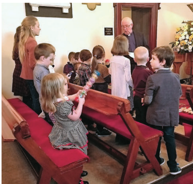
Children enjoying Palm Sunday Service