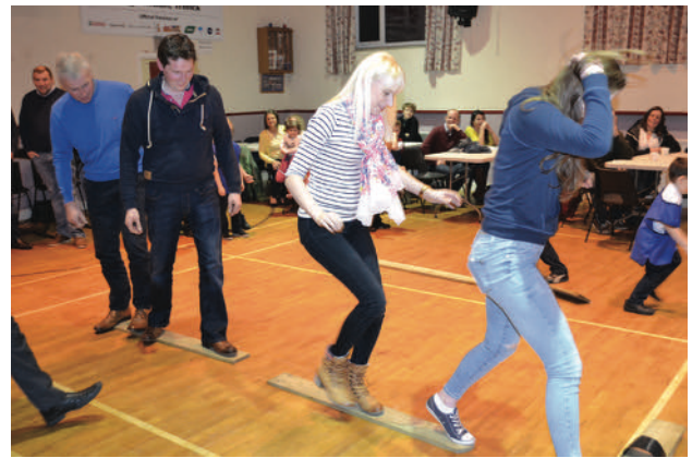
Parents join in the fun at BB

And, at the time of writing, we are looking forward to a Mini Auction/Table Top and Coffee Afternoon at Kilskeery Parish Hall on 16th April, with our Parish BBQ planned for July 8th!!