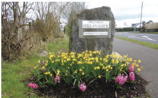
The Bellanaleck nameplate stone decorated with flowers

At the March meeting of The Group, it was agreed to inform the Police, their concern about speeding vehicles through the village.