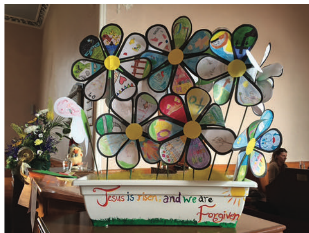
The Easter Garden

Holy Communion in Sallaghy. This was followed by a well-attended Praise Service at 11.00am in Galloon.