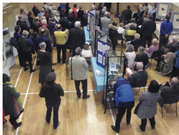
Local History Group Evening

The exhibition opened early on Sunday 17th to facilitate members of the congregation leaving Church.