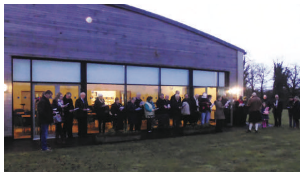
Easter Sunday outside The Cleenish Centre

Once again it was lovely to join together to celebrate the Resurrection of our Lord, on Easter Sunday morning. It was great to see that the wet weather, and the change to British Summer time did not deter the faithful number of both young and old who attended, and who stayed to enjoy the breakfast and fellowship afterwards.