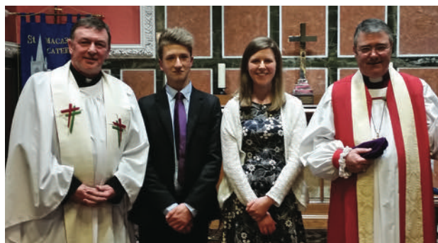
Confirmation Candidates presented to the Bishop on Sunday 17th April