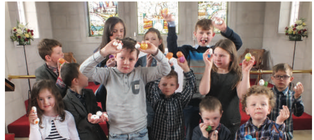
The Easter Egg Hunt in Belleek Church, was enjoyed by all the Sunday School children and also some of the adults!