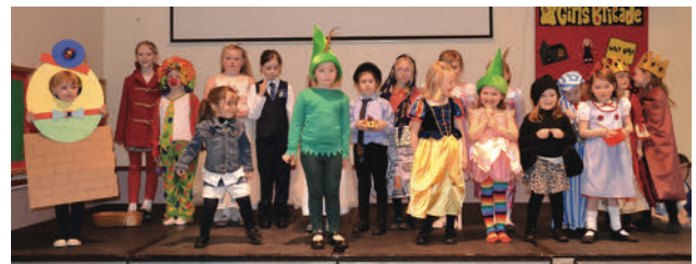
Younger members of our GB having fun