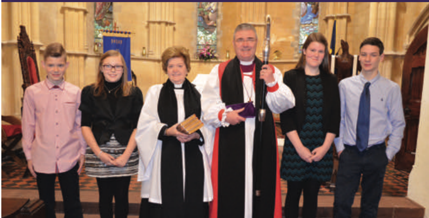
Confirmation Day in Donagh Parish