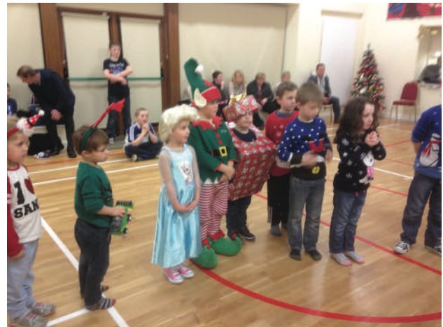
Judging children's Christmas outfits at the party in Dartrey

a big bag of presents. Thanks and appreciation to everyone who organized the evening and also for supplying and serving refreshments.