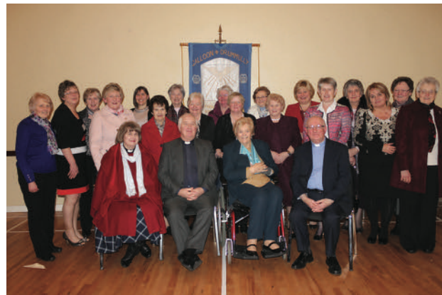
Galloon & Drummully MU members with 60th Anniversary Service special guests