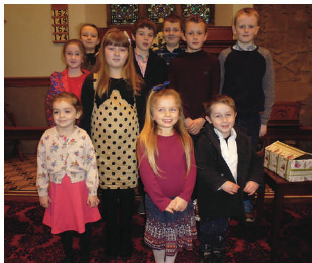
Cleenish Sunday School