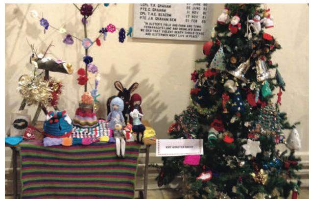
Some of the beautiful Christmas Trees