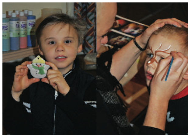
Fun at the Sunday School Christmas Party

Lisbellaw Parish website is not available to us for editing. Please see our Facebook page for up to date information on parish events.