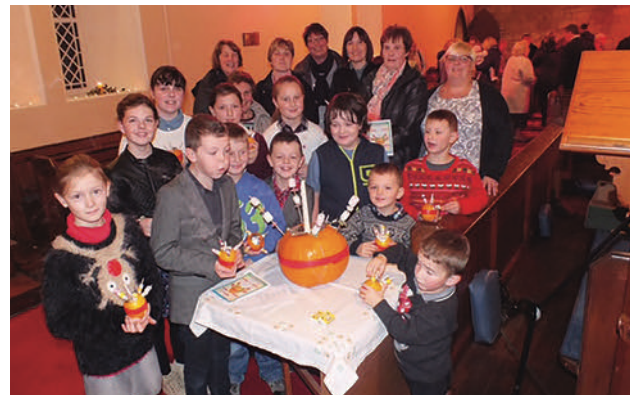
Christingle Service in Kiltyclogher