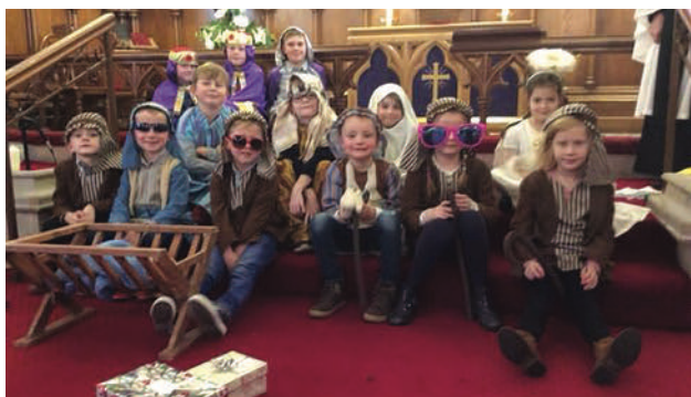
Sunday School Nativity Play

story of Christmas. The children were dressed up in the traditional garb and made the congregation smile with their readings and singing. Well done to them and their teachers - thank you! And yes, the sunglasses were part of the story!! (looking at the bright star over Bethlehem)