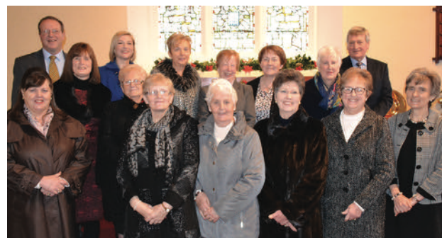
Kilskeery & Trillick Choir