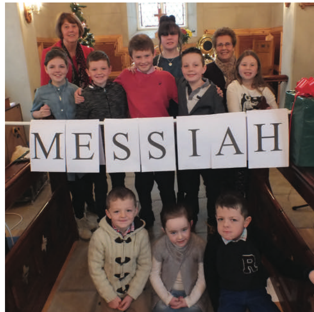
Slavin & Belleek Sunday School children with teachers