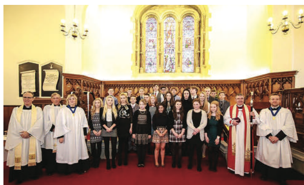
Confirmation December 2015