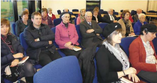
Faith Mission Service in Cleenish Centre

We were delighted to see so many attended the Carol Service held by the Faith Mission in the Centre on Sunday 6th December, it was especially good to welcome our local community. What a lovely way to see out 2015, and we eagerly anticipate what 2016 will bring as we continue to focus on Mission. Judging from the response of bookings in February and March the year ahead looks very busy, and so creating an opportunity for people to serve in many ways. If you feel you are called to serve in this way please contact the Centre by email: enquiries@cleenishcentre.com or tel: 028 66 349647.