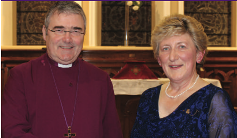
Commissioning of MU President