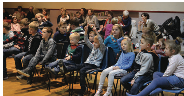
Christmas Party Fun - Kilskeery & Trillick