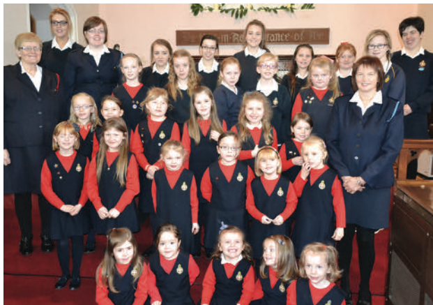
Girls' Brigade Enrolment

The Enrolment Service took place, by candlelight, during our Advent Carol Service on 29th November. Additional funds were raised with a 'Coffee Evening and Sale' on 30th November and we thank all those who gave so generously. Girls prepared gift bags, complete with hand-made Christmas Cards which were distributed by the Rector to our housebound sick and were wonderfully received!