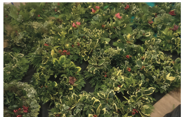
Floor of handmade wreaths

The model flyers are back in Ballycassidy Hall on Monday evening for the next few months. If you would like to learn more about the hobby come along after 7.00pm.