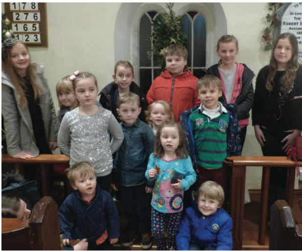
Crib Service in Coolbuck Church