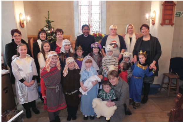
Garrison Sunday School children with Rector & teachers