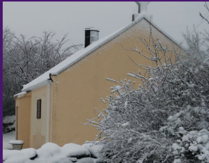
Winter at Coolbuck Church