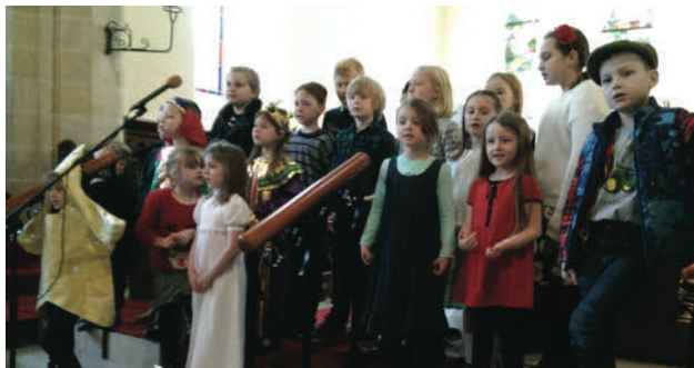
Away in a Manger: Members of the four Sunday schools

Thank you for support. The excellent result of €6,090 is wonderful. Our sincere thanks to all who supported the Fayre and to all those who worked so hard preparing it and on the day.