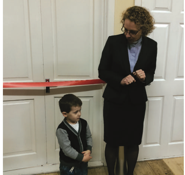
Ribbon cut by the youngest parishioner in Killeevan.

On the Fourth Sunday of Advent parishioners from all four parishes gathered in St Laebhan's Church Killeevan for an Advent celebration led by the children in the four Sunday Schools. We all enjoyed their Christmas plays they prepared, the poems and the many Carols. Our sincere thanks to all who participated and helped prepare this service.