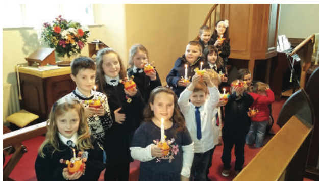
Children at the Christingle service in Drum

The club are holding their Annual Beetle Drive in the parish hall on Saturday 6th February at 8.00pm. Everyone is welcome and bring a friend.