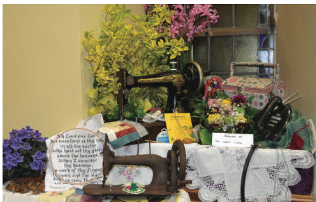
The church was open over the course of the weekend with tea available for those viewing in the hall, with donations towards mission charities.