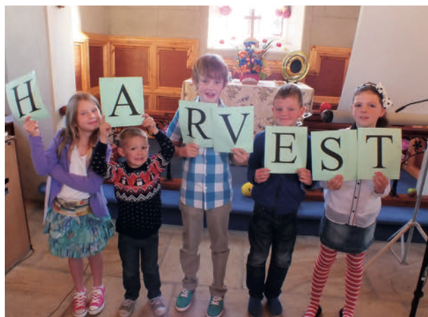
Slavin Sunday School children