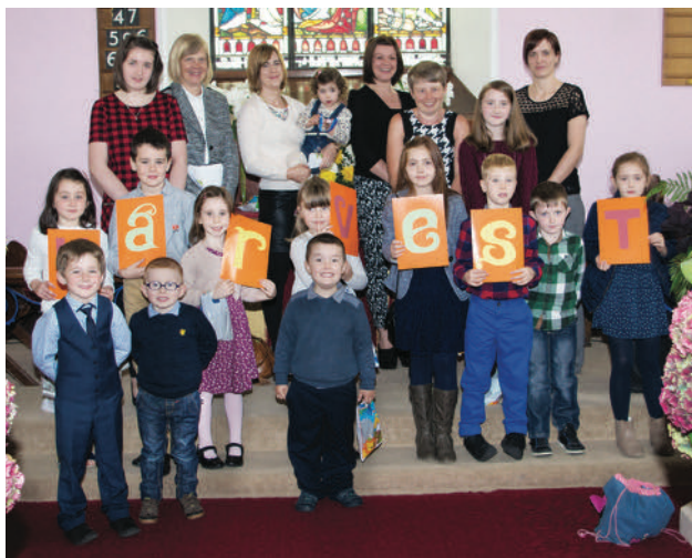
Children and Sunday school teachers who took part in Clogh children's Harvest service on Sunday 28th September