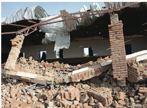
The Sudanese Air Force dropped four bombs on an Episcopal Church of Sudan complex in the Nuba Mountains on Friday 10th October, church leaders said.