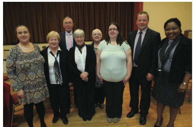
Those who helped with the tea & decorating the church at Kiltyclogher