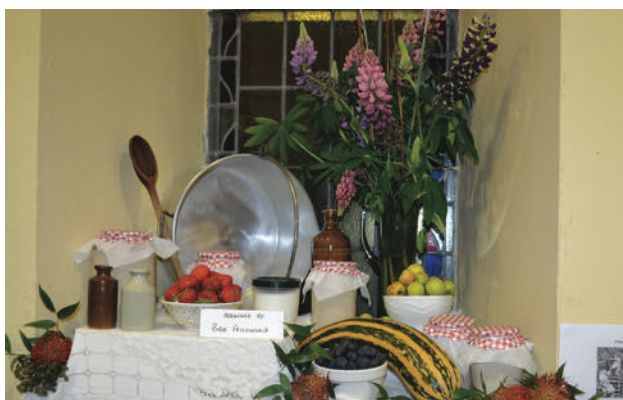
Each of the parish groups arranged windows, themed around particular aspects of farming practice, ploughing, threshing, milking, root crops, fruit, shepherding and crafts.