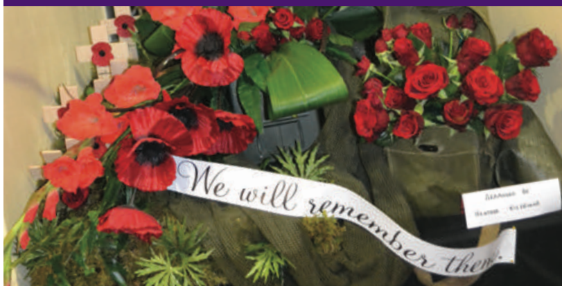
Preparations for Remembrance Sunday