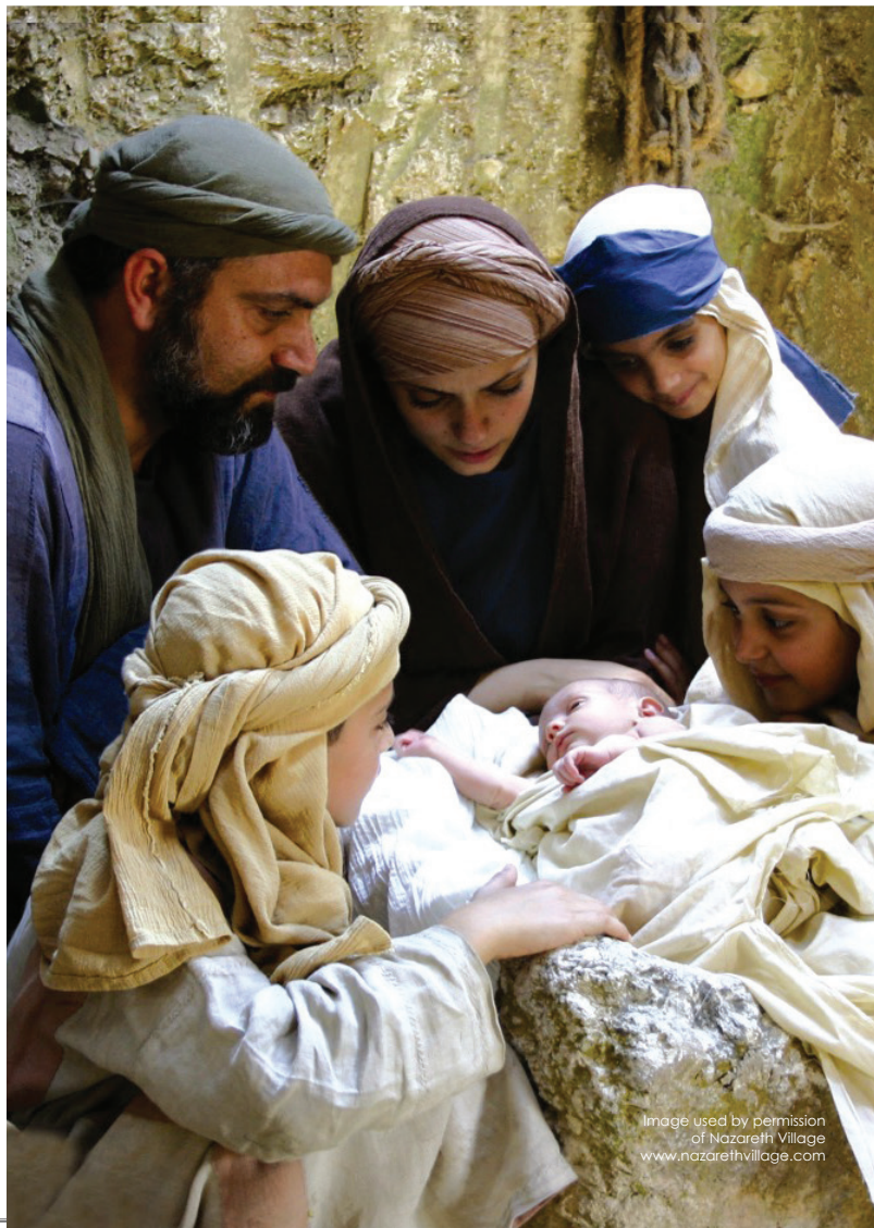
Image used by permission of Nazareth Village www.nazarethvillage.com

45 Main Street, Irvinestown BT94 1GL Tel: (028) 686 21616 Fax: (028) 686 28019