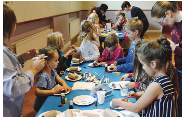
Messy Kids - Baby in a basket 'Production Line'