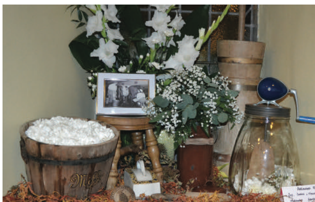
We would thank everyone who left in produce, items, made teas, provided food and the usual harvest fayre,