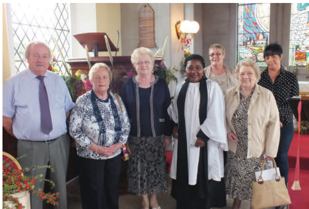
Belleek Parishioners celebrating the Harvest with the Rector