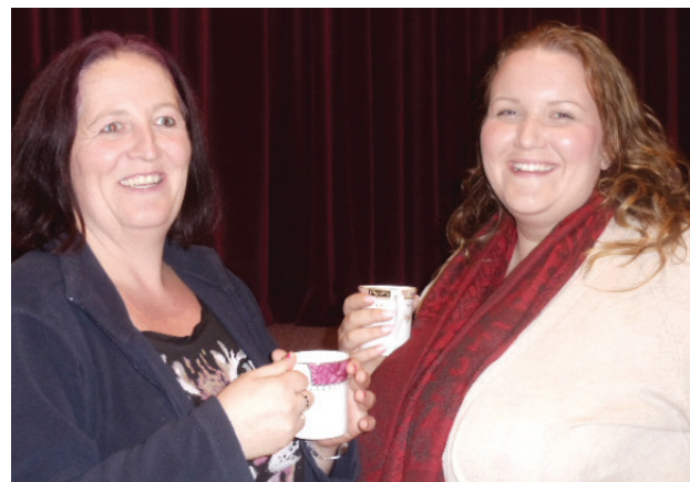
Catching up over a cup of tea at the Sunday School teacher training in Maguiresbridge

Thanks to the two host parishes for providing excellent facilities as well as refreshments at the end of the evenings. Thank you also to everyone who attended the evenings - we trust you have been encouraged and enthused for the weeks and months ahead in your important work in children's ministry.