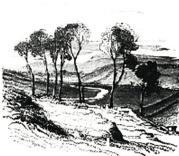
Old Rossorry looking southwards

Following advice from the Provincial Architect of the Church of Ireland that the old church of St Fanchea at Lisgoole was incapable of permanent repair and too small for the parish population of 2,232 souls! - the Vestry decided in 1835 to build a new church where it stands today. (St. Fanchea was one of four daughters of Conall the Red, prince of Oriel, in Ulster, and Briga, his wife. The other daughters were St. Lochinia, St. Carecha and Darenia, who married Angus, King of Cashel. Fanchea was born at Rathmore, near Clogher. She was early sought in marriage by Angus, son of Natfraich, king of Momonia, who did all he could to gain her consent,