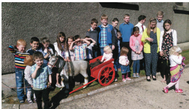
Children from St Marks, Aghadrumsee who took part in the special Harvest Children's Service on 21st September.