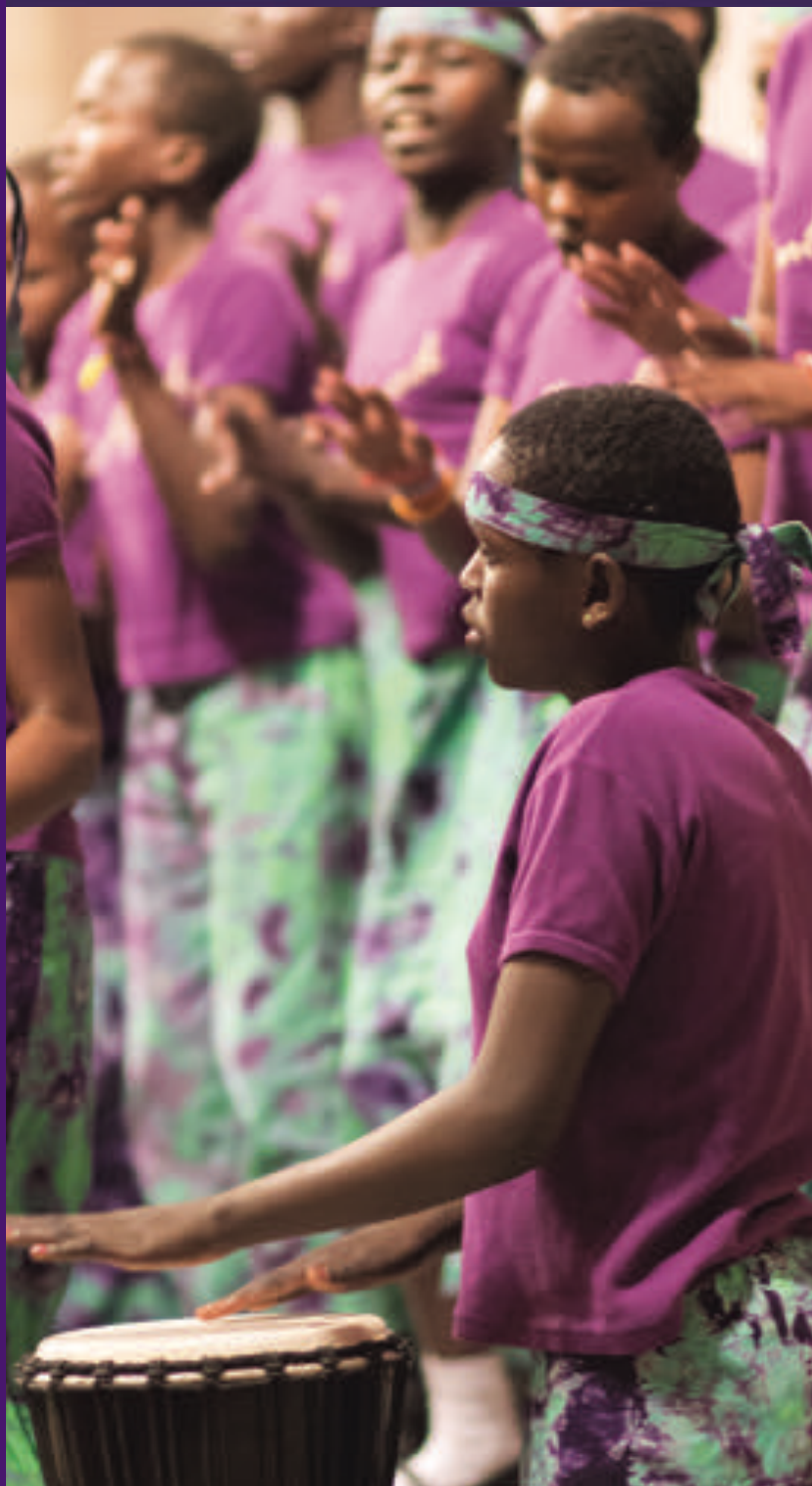
Outreach by Kenyan Children