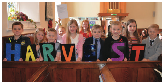
Some of the children who took part in the Family Harvest Thanksgiving Service