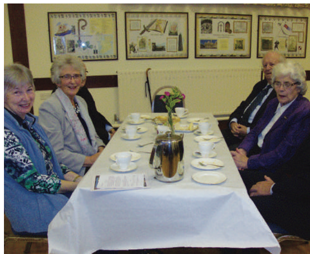
Ready to enjoy the harvest supper