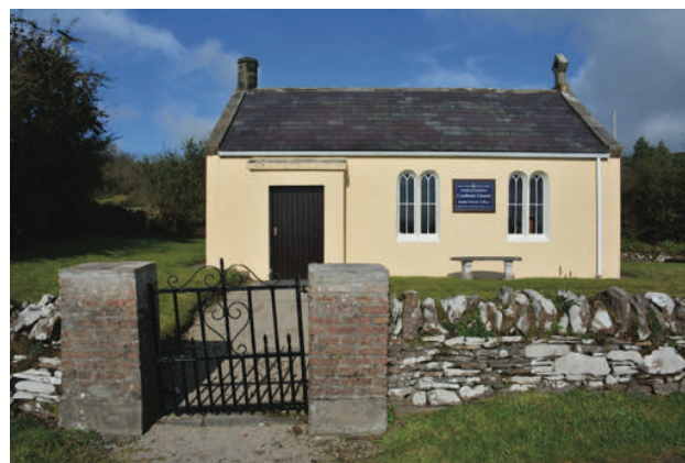
Coolbuck Church pictured after the capstones had been stolen