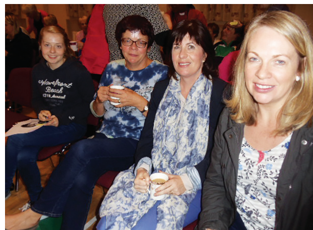
Sunday School Teachers at Maguiresbridge training