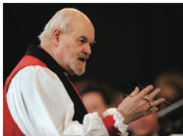
Bishop of London