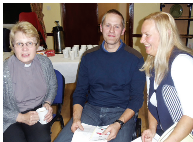
Sunday School teachers from County Monaghan