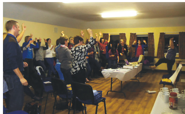
Singing Father Abraham in Monaghan