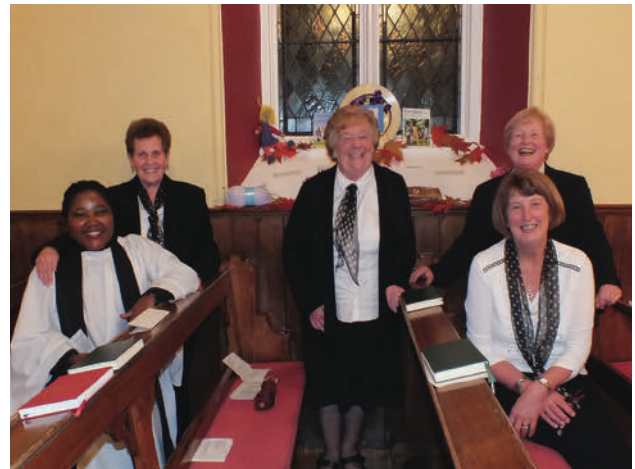
The Mothers' Union Window Nov 14 - Some MU ladies with the Rector beside the Harvest MU Window

This year the Sunday School children in Garrison assisted by their teachers decorated a window in the church. The Mothers' Union also decorated another window depicting its' logo. A delicious supper was served in the church hall by the ladies of the Parish.