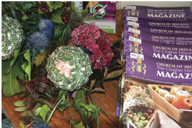
Getting ready for Harvest 2014

Coolbuck parishioners and many from further afield were shocked and saddened just two weeks later to discover that two capstones which enhanced the entrance to their church had been stolen during the night of Tuesday 7th October. The Coolbuck community is a very close-knit one and many people have been deeply hurt by this calculated action.