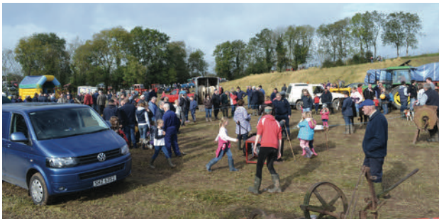
Vintage Working & Family Fun Day.