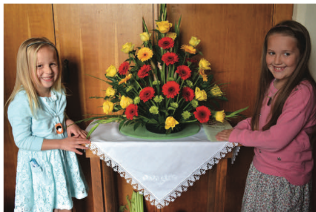
Two lovely ladies admiring the flowers!